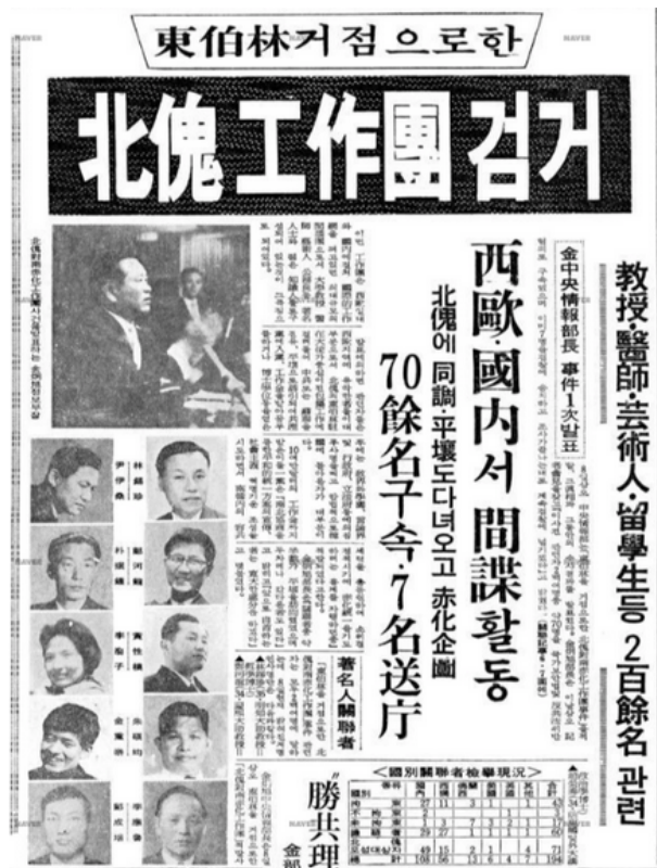
Figure 4: "Arrest of North Korea's East Berlin communist espionage operation," Kyŏngnyang Sinmun , July 8, 1967. Yun Isang's photograph is top left among the ten photographed figures.

More sympathetic reports also began to appear in early December of 1967, a few weeks before the first trial. Such reports were a response to the increasing international attention that the case of Yun and the broader scandal were attracting. 28 Nevertheless, an awareness of increased international attention among domestic journalists did not mean they could freely introduce foreign coverage surrounding Yun and the East Berlin Affair. At this time, journalists could pay dearly if their reports on world affairs did not conform to the state's position on North Korea. For example, in 1964, the KCIA jailed the well-known reporter Rhee Yŏngghi for reporting the United Nations' consideration of granting admission to both