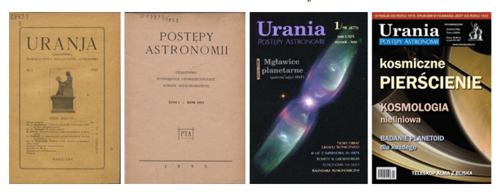
Figure 1. Covers of Urania. From left: first issue of Urania 1/1922, first issue of Postępy Astronomii 1/1953, first issue after merging Urania with Postępy Astronomii 1/1998, nowadays Urania 2/2018.

A large reform of Polish orthography was conducted in 1936. The result of these changes was the transformation of the title from Uranja into Uranja . The latter version has been kept until now.