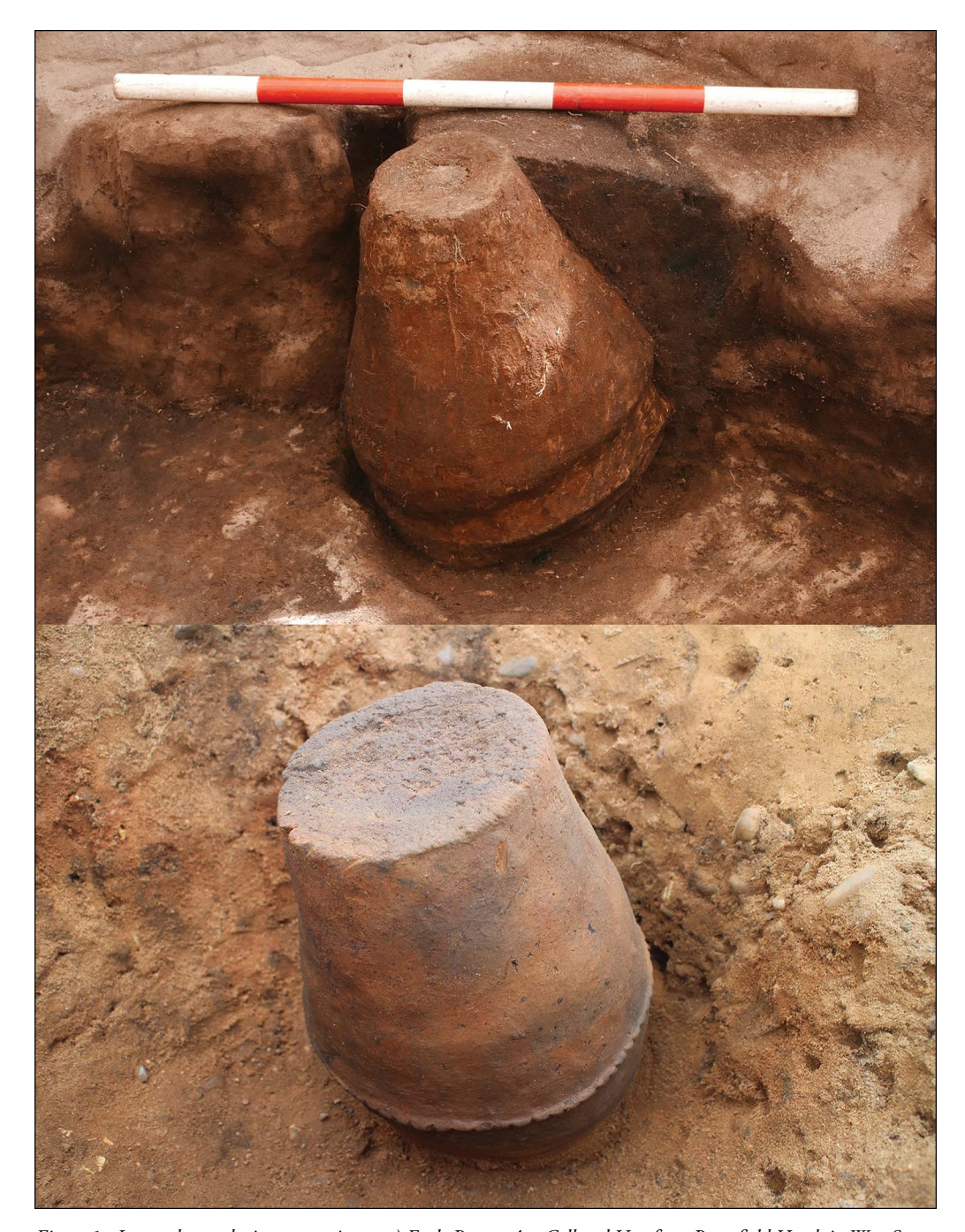
Figure 1. Inverted urns during excavation: top) Early Bronze Age Collared Urn from Petersfield Heath in West Sussex; bottom) Middle Bronze Age Bucket Urn from Newark-upon-Trent.