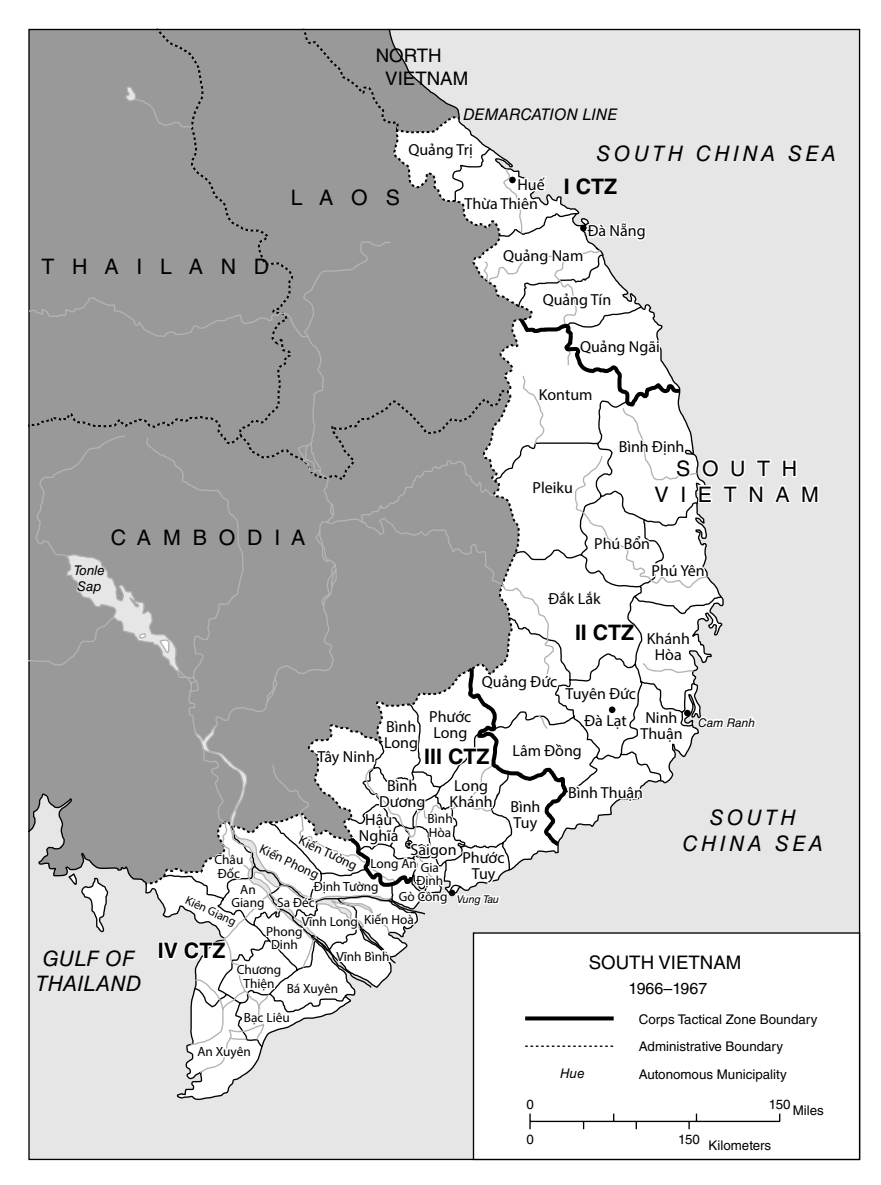
Map 0.2 The Corps Tactical Zones (CTZs) designated by the armed forces of the United States and South Vietnam.