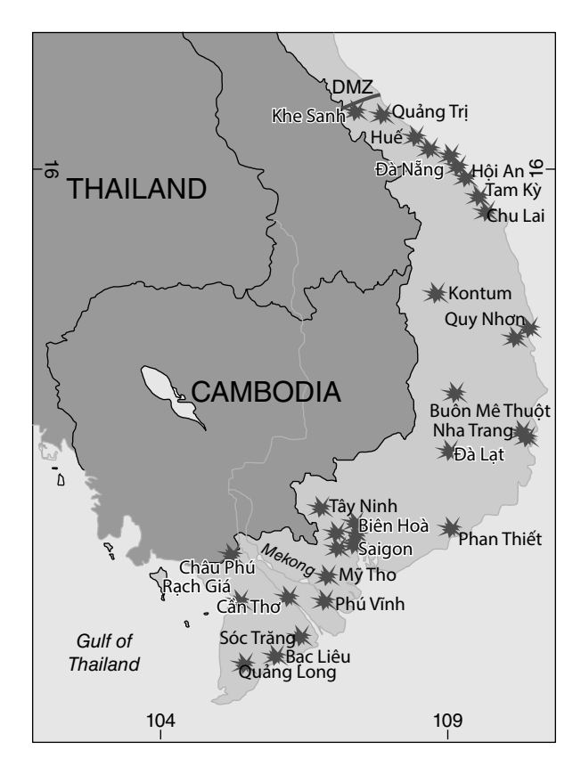
Map 0.4 The Tet Offensive, 1968.