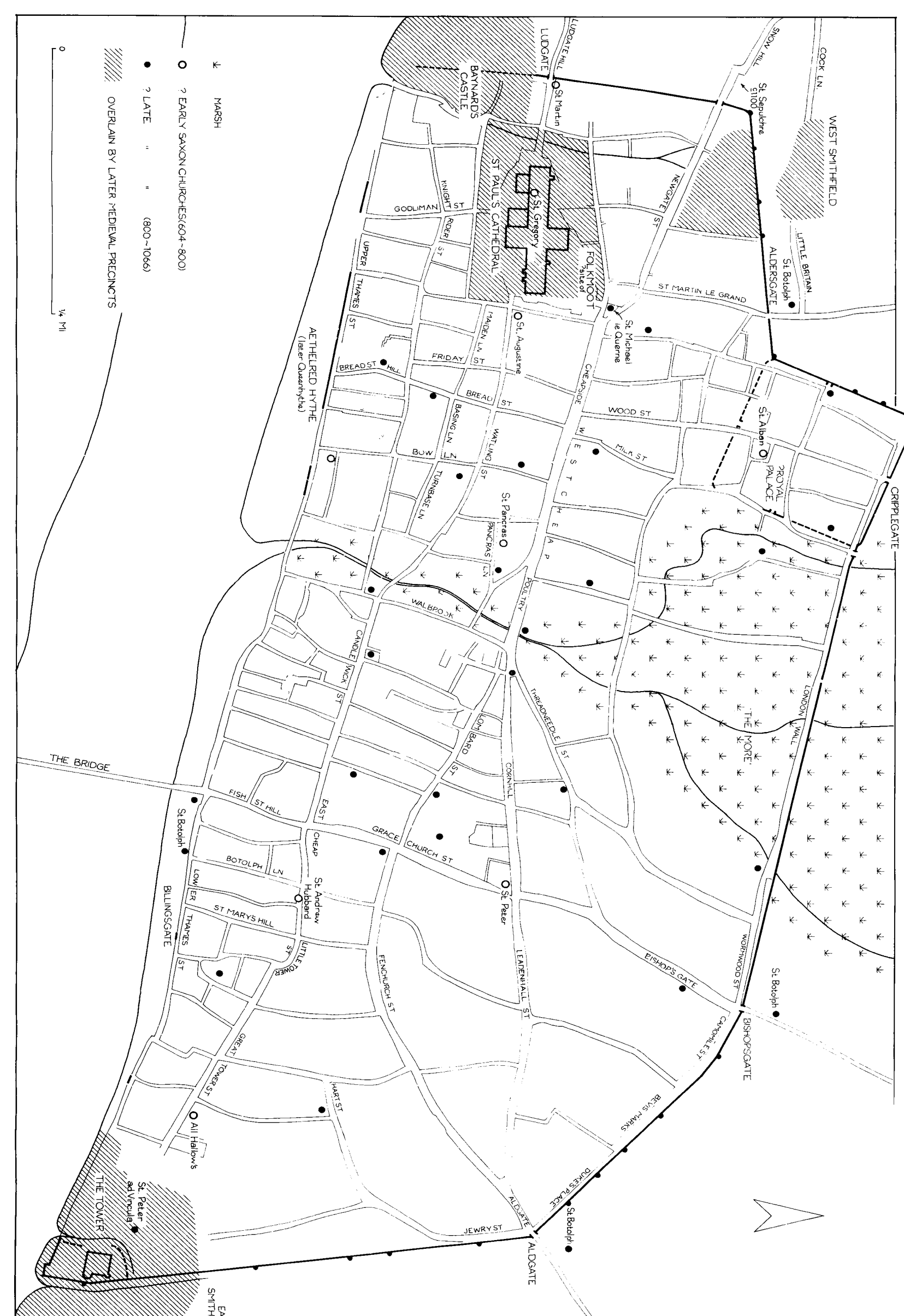
Fig. 1. The City of London in the Late Anglo-Saxon period showing streets, places and churches mentioned in the tex