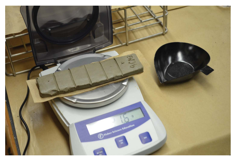
FIGURE 6. Weighing completed sample clay test bar for wet weight used in calculating percent Water of Plasticity.

FIGURE 5. Marking bar with 10-cm distance with metric calipers for percent Linear Drying Shrinkage measurement.