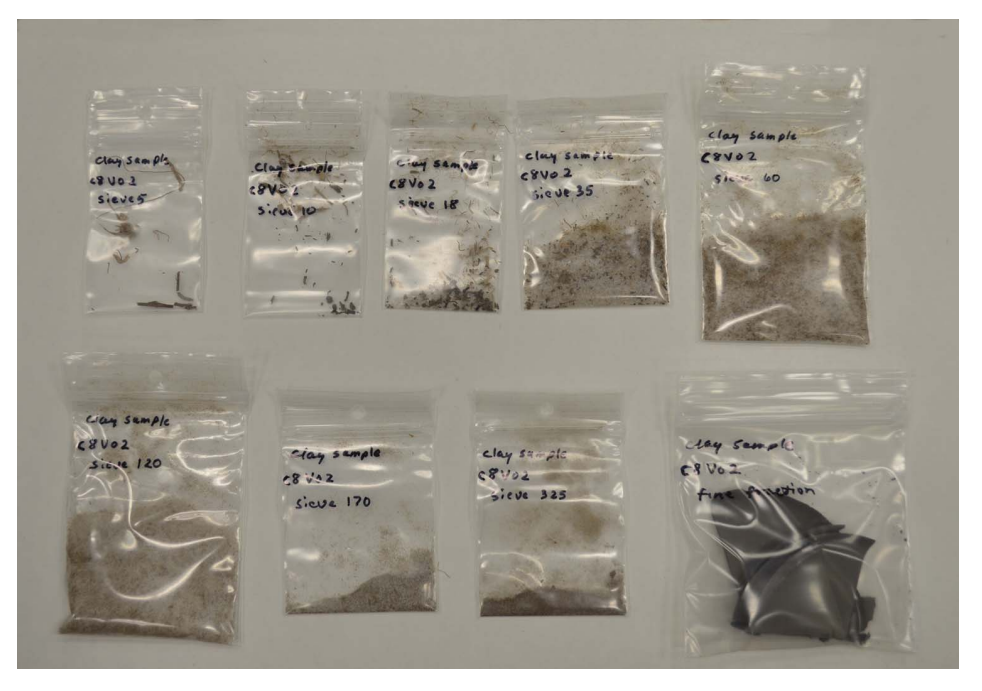
FIGURE 11. Sieved sediments bagged and labeled for curation.