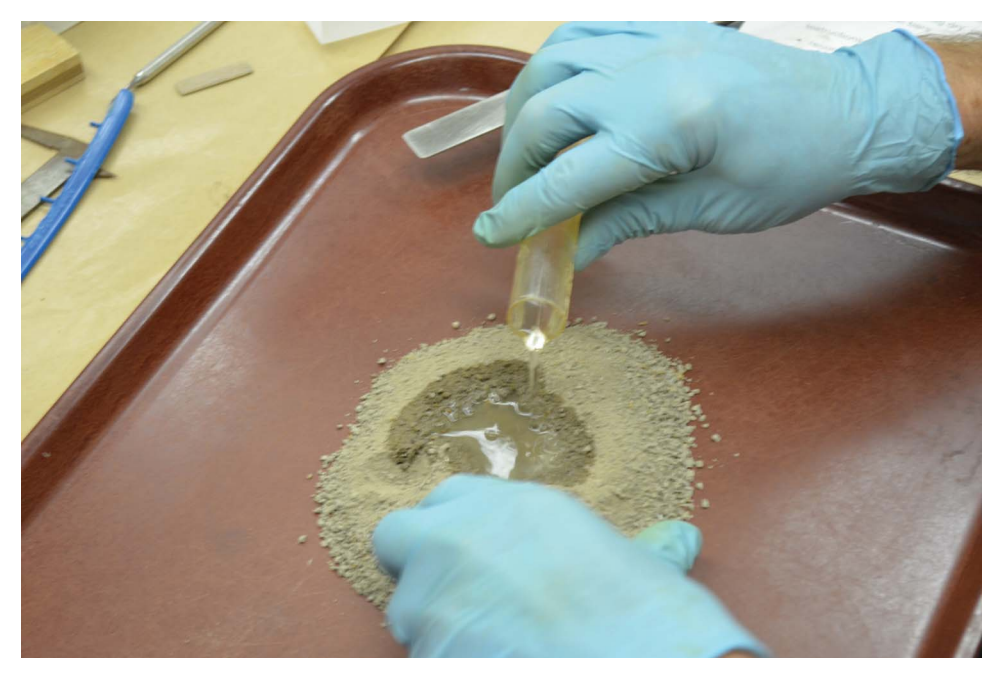
FIGURE 1. Water is added to depression in the pile of dry, crushed clay sample.