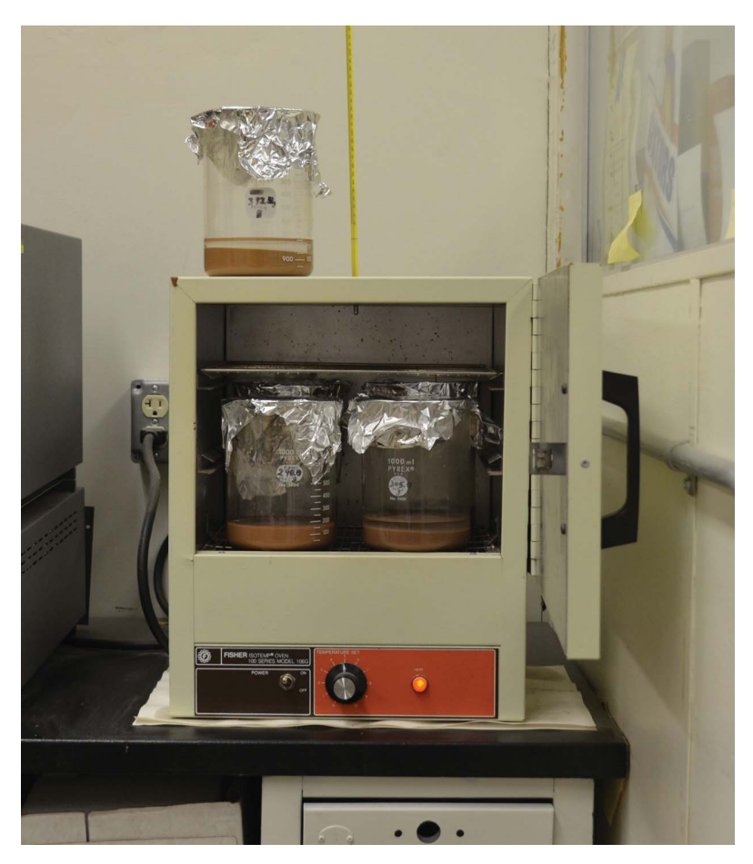
FIGURE 12. Beakers of fine fractions in drying oven (another sample, waiting for space in the oven, is sitting on top, getting a head start on the drying process).