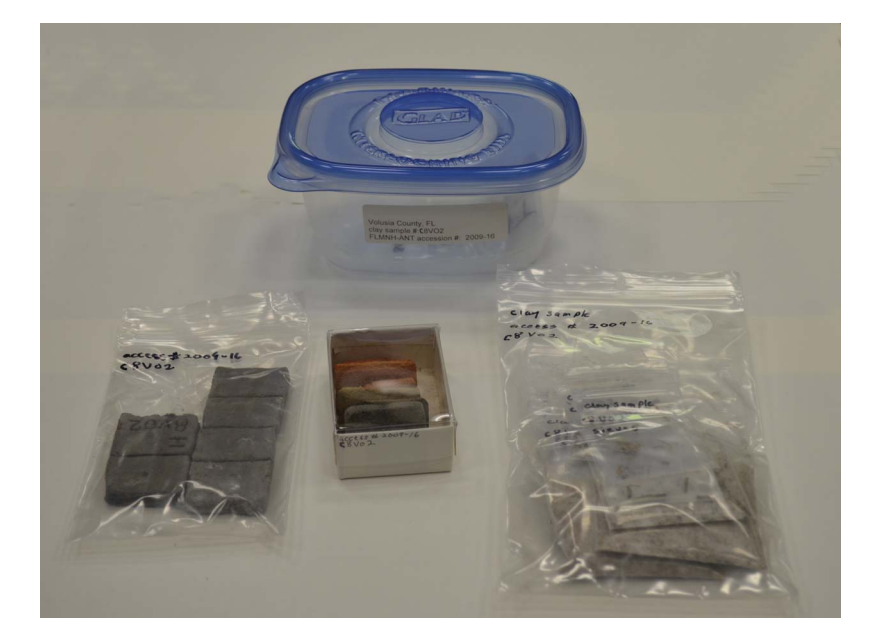
FIGURE 13. Processed sample clay ready for curation: (top) storage container, (bottom, left to right) leftover test bar, boxed fired briquettes, and bagged sieved sediments.

Gilmore 2016; Pluckhahn and Cordell 2011; Wallis 2011; Wallis and Cordell 2013; Wallis et al. 2016), a much broader sample is essential.