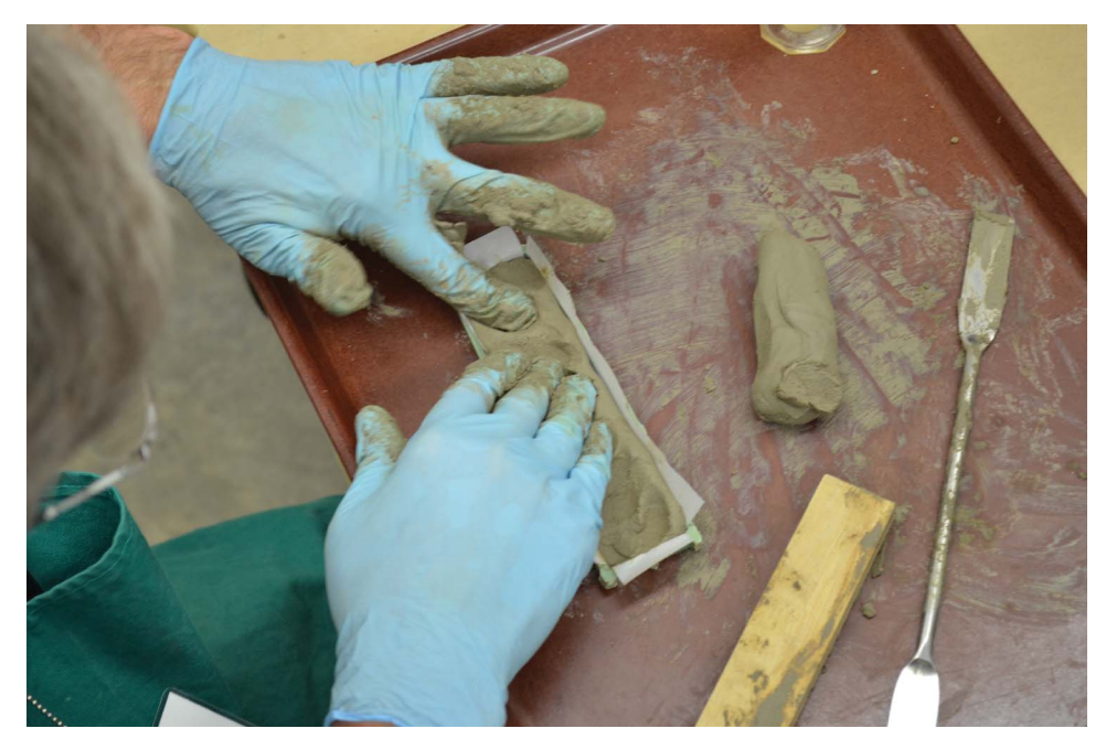
FIGURE 3. Pressing a "log" of plastic sample clay into a test bar template, lined with parchment paper (our template is recycled from an old army surplus industrial dishwasher rack; soon we will have a printable 3D file of this template to share with interested researchers).