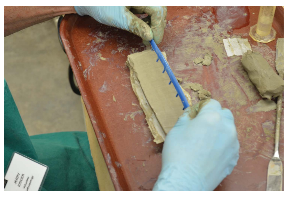
FIGURE 4. Marking scoring distances on sample clay test bar (with recycled hair comb tool). Take care that follow-up scoring lines are shallow (about 1 mm) to avoid compromising the integrity of the bar (if too deep, the bar may separate along a scored line during drying).

FIGURE 3. Pressing a "log" of plastic sample clay into a test bar template, lined with parchment paper (our template is recycled from an old army surplus industrial dishwasher rack; soon we will have a printable 3D file of this template to share with interested researchers).