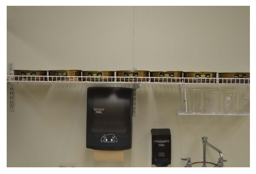
FIGURE 10. Sieved sediments air drying in the lab.

aplastics (e.g., Lollis et al. 2015), but space limitations prohibit routine curation of additional sample leftovers.