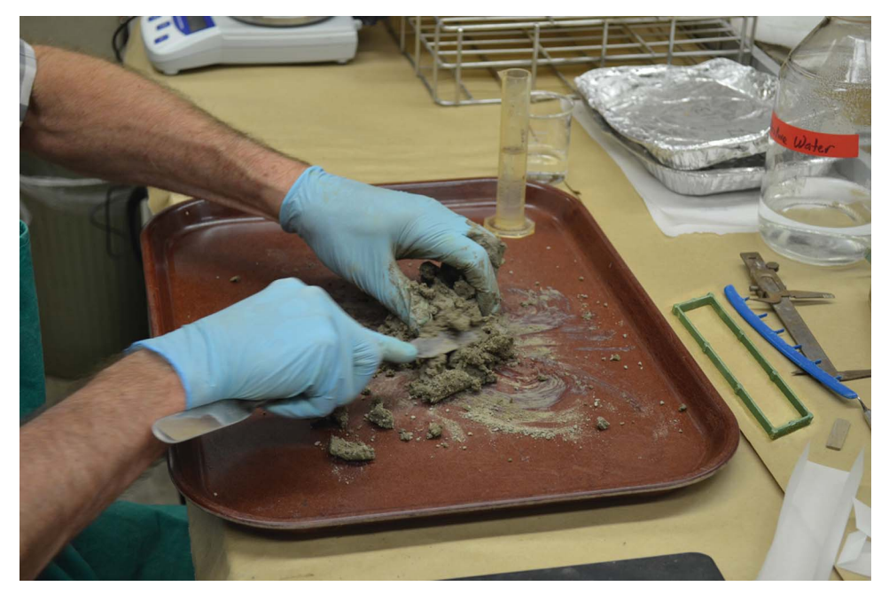
FIGURE 2. Working the clay and water into a plastic mass (test bar template also pictured).

are double-bagged in 4-mil zipper bags. Sealed processing contains dust generated during crushing/pounding, and reduces sample loss. A glass mortar and pestle is used for small samples.