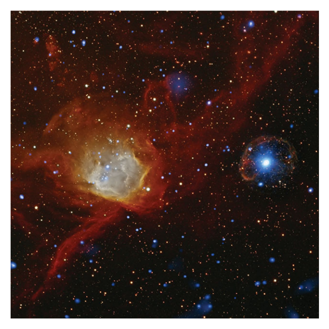
Figure 1. Combined X-ray (blue) and optical (red, yellow) image of NGC 602 and the SNR around the X-ray pulsar SXP 1062. North is up, east is to the left. Image size is 14', see http://chandra.harvard.edu/photo/2011/sxp1062/

In this canonical model, long periods in excess of 1000 s can be achieved if B > 10^{14} G or \dot{M} < 10^{12} g s<sup>-1</sup>. On the other hand, a new model for wind accretion (Shakura et al. 2012) allows long spin periods and high period derivatives even for standard magnetic fields. The model predicts specific correlations between the behavior of the spin and luminosity. An alternative model to explain long-period pulsars with P_{\rm spin} \gg P_{\rm eq} comes from Ikhsanov (2007), who postulates that prior to the accretion powered phase, a subsonic propeller phase may take place. Steady accretion under the condition P_{\rm spin} > P_{\rm eq} can be realized when the cooling of the envelope plasma dominates the energy input.