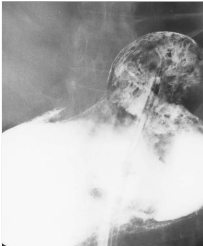
Fig. 2. Upper GI series: A large hiatus hernia is noted. The lower portion of the stomach has flipped into the thoracic cavity consistent with an organoaxial volvulus. The pylorus has a "beaked" appearance suggesting an outlet obstruction.

Gastric volvulus can present as an acute surgical emergency or a chronic, recurring problem. Approximately \frac{1}{3} of all episodes present acutely with sudden, severe left upper quadrant or left lower thoracic pain. Pain may radiate to the back, neck or interscapular area and may be accompanied by dyspnea. Vomiting occurs and quickly progresses to dry heaves. The upper abdomen may be distended while the lower abdomen remains flat and soft. Borchardt's