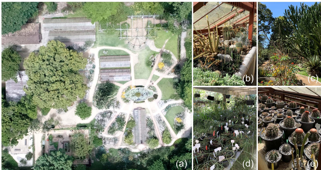
PLATE 1 Rio de Janeiro Botanic Garden Cactarium, Brazil: (a) aerial view, (b) greenhouse for visitation, (c) outdoor flower beds, (d) pergola with the shade plant collection, (e) greenhouse for research.

We consulted information on the inventoried plants in the institutional specimen registry system, Jabot (Silva et al., 2017). We checked and updated scientific names, following Flora e Funga do Brasil (2023) for native species, and the Tropicos database (Tropicos, 2023) and the Plants