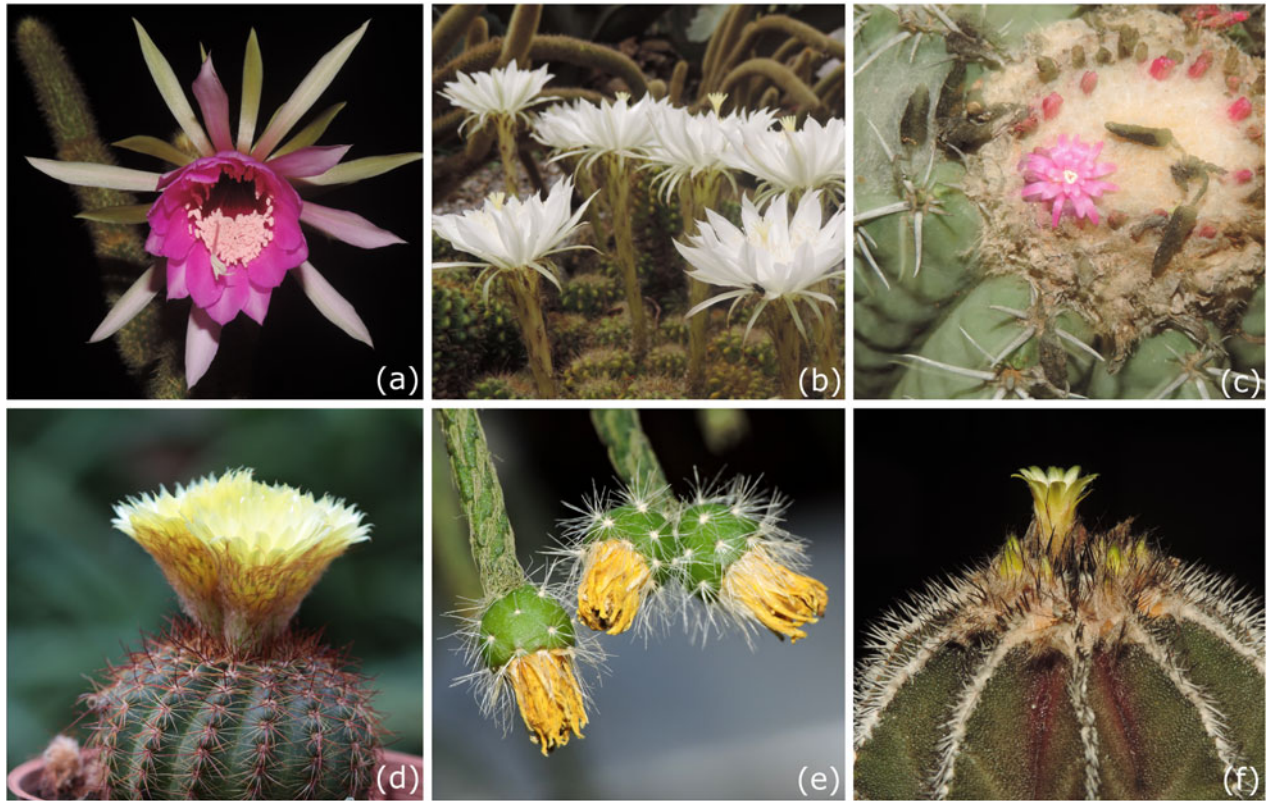
PLATE 2 Some of the threatened species in the Rio de Janeiro Botanic Garden Cactarium (Plate 1): (a) Arthroocereus rondonianus, (b) Echinopsis calochlora, (c) Melocactus glaucescens, (d) Parodia ottonis, (e) Rhipsalis pilocarpa, (f) Uebelmannia pectinifera.