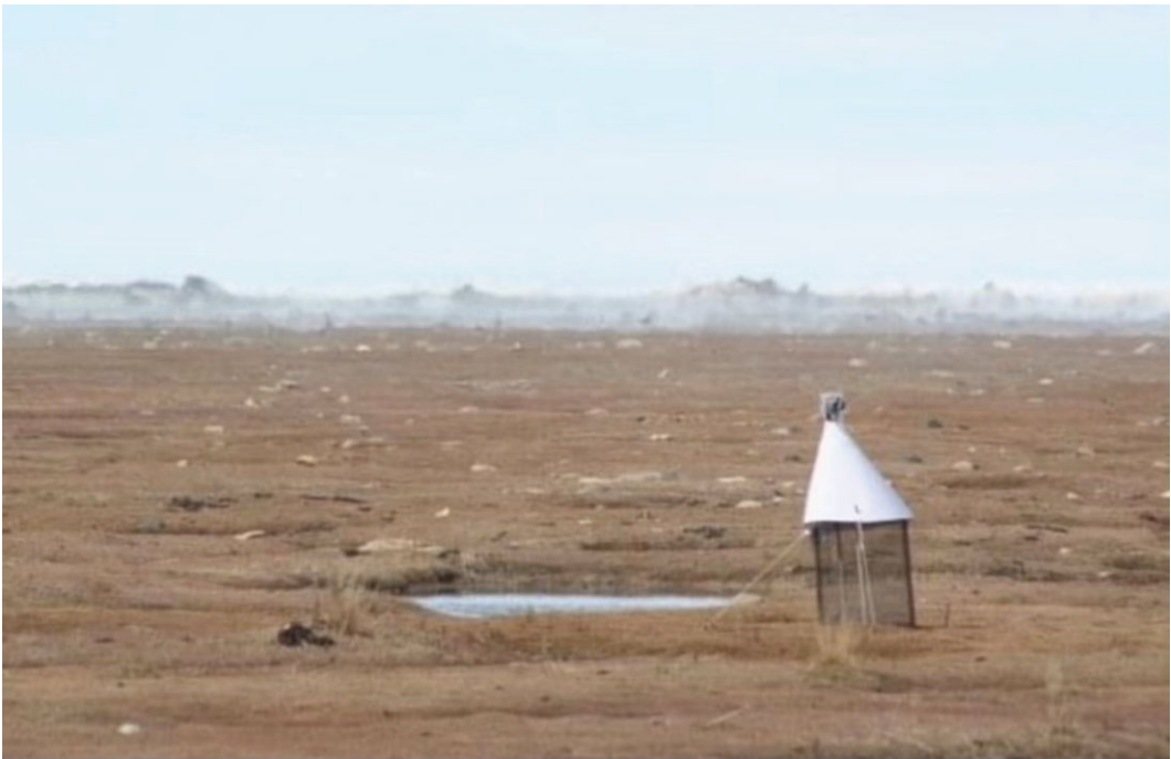
Figure 2. Photograph of International Polar Year (IPY) trap set on the coast of Akimiski Island, Nunavut, Canada. The pitfall portion of this trap is set below the interception screen at ground level. The white cone acts as a rain shield to prevent the pitfall trough from filling with rainwater and as a funnel to direct climbing insects up into the collection head at the top.