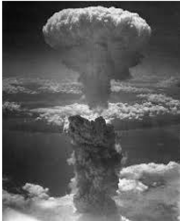
Iconic image of the Hiroshima bomb