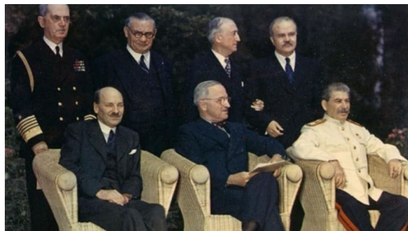
Atlee, Truman, Stalin at Potsdam

followed this policy faithfully. This was because Japan had engaged in military aggression igniting the war (an unjust war) and had committed numerous atrocities against American and Allied soldiers (violations of justice in warfare). In order to defeat Japanese militarism so that Japan could never rise again as a military power, the United States and its allies sought to impose unconditional surrender. But as the war developed, certain very influential people within the government – such as Secretary of War Henry Stimson, Secretary of the Navy James Forrestal, and Deputy Secretary of State and former Ambassador to Japan Joseph Grew – thought it necessary to define what “unconditional surrender” exactly meant. Particularly important was the status of the emperor. If the United States were to insist on unconditional surrender, particularly if it were to insist on trying or punishing the emperor, as some within the administration insisted, they were convinced that the Japanese would fight on to the very last man. Therefore, they argued, in order to terminate the war, the US would have to define the terms in such a way that it could allow the Japanese to preserve the monarchical system, even under the current dynasty.