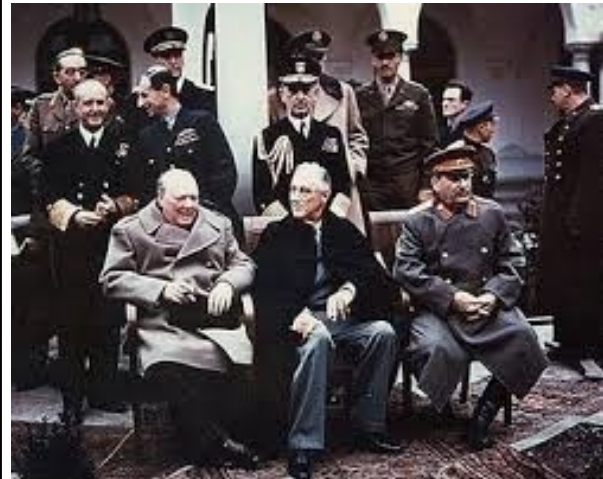
Churchill, Roosevelt and Stalin at Yalta

With regard to the first assumption, I have to point out that two very important options were available to Americans. And in fact, the options were presented in the course of the deliberations of the US government. The first option was to welcome Soviet entry into the war. By the end of 1944, US leaders had come to the conclusion that in order to force Japan to surrender, invasion of Japan's homeland would be necessary. The successful execution of this strategy would require Soviet entry into the war in order to pin down the Japanese forces in China and Korea.