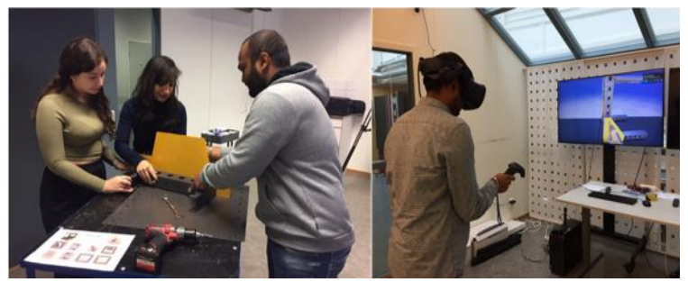
Figure 4. Students conducting the test

In general, the students stated that, with better training, VR has many advantages and that they wanted to learn more about and how to use VR for their future work life. Given the potential advantages of VR for the future, the students hope that training with VR will become more accessible. Especially since it is possible to save a lot of time by training with VR, as you do not need to disassemble in order to reassemble every time you practice an assembly task.