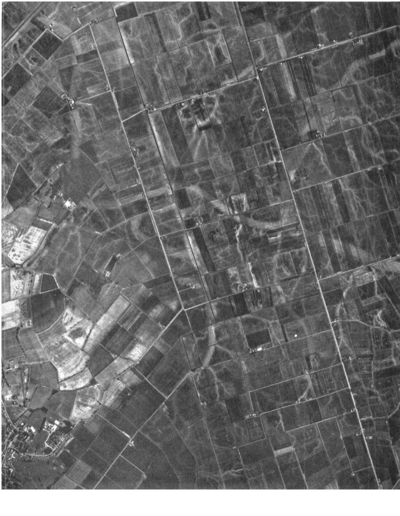
PLATE XXXVI: AIR RECONNAISSANCE: RECENT RESULTS, 36 Fenland, E of Ramsey, Huntingdonshire. Vertical photograph, taken 3 April 1969. Scale 1:23,000. The long sides of the photograph lie approximately NE and SW