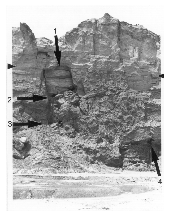
Figure 4 The north-eastern face of Mount Sedom, with four-level outlets (indicated by numbers) of Mishqafaim Cave: Level 1 is the uppermost outlet dated by two radiocarbon ages to 3100 \pm 55 and 3030 \pm 50 BP. The passage is close to the top of the salt (indicated by triangles), just under the caprock; Level 2 is lower, with ages ranging from 1990 \pm 50 to 1690 \pm 50 BP; Level 3 is dated to 930 \pm 50 and 885 \pm 95 BP; Level 4 is active today

sea shore. The Dead Sea reached the base of Mount Sedom at this stage and the outlets of most caves are graded to about –390 m.