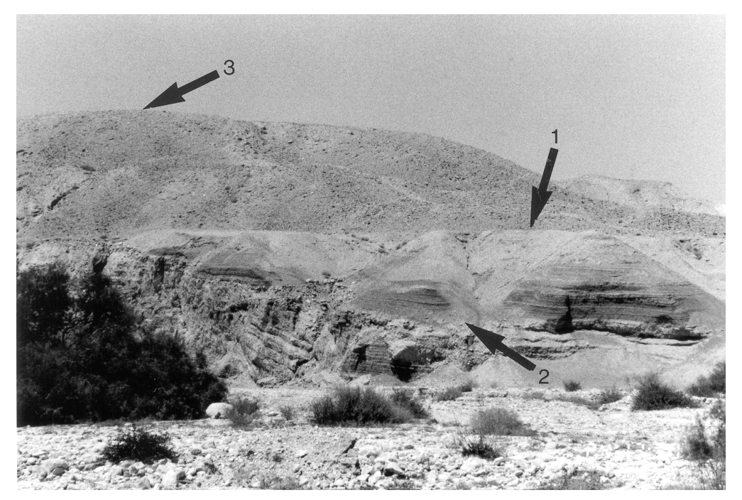
Figure 3 The main terraces at the northern wall of Nahal Darga, with active channel at the bottom: (1) Top of mid-Holocene terrace, with a beach ridge at a level of about –370 m. (2) Contact between early Holocene (?) and mid-Holocene layers; (3) Late Pleistocene fan-delta terrace

The end of this early Holocene wet event is less well dated. In Nahal Zeelim this falling lake event is indicated by a depositional shift from clay to gravel, occurring about 2 m above the uppermost age, 8255 \pm 70 BP (RT-947) (Yechieli et al. 1993). Goodfriend et al. (1986) reported a high lake level of -280 m which precipitated salt over land snails dated to 6660 \pm 400 BP (RT-725). The receding lake has exposed the top of the southern Mount Sedom to salt karst development (Frumkin 1996a), as indicated by the earliest cave in the mountain dated to 7090 \pm 75 BP (RT-886H) (Frumkin et al. 1991). This is followed by downcutting in the cave indicating rapid fall of the lake level.