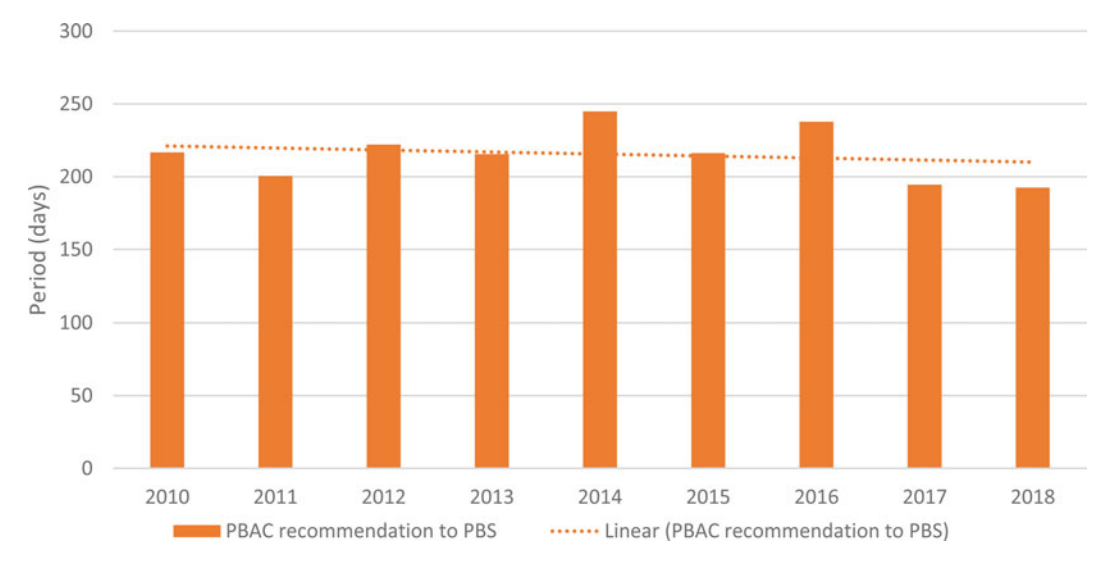
Figure 3. Period from the date of PBAC recommendation to the date of PBS listing.