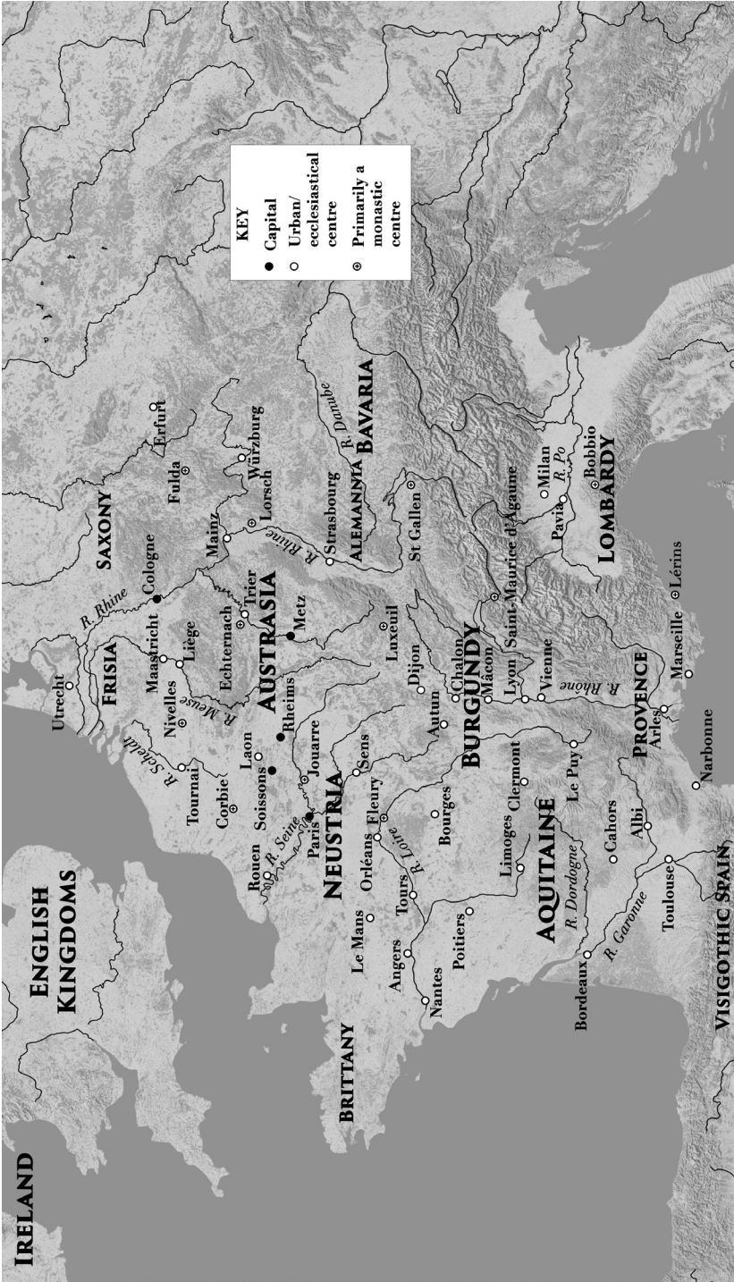
Map 2 Merovingian kingdoms, capitals, and centres