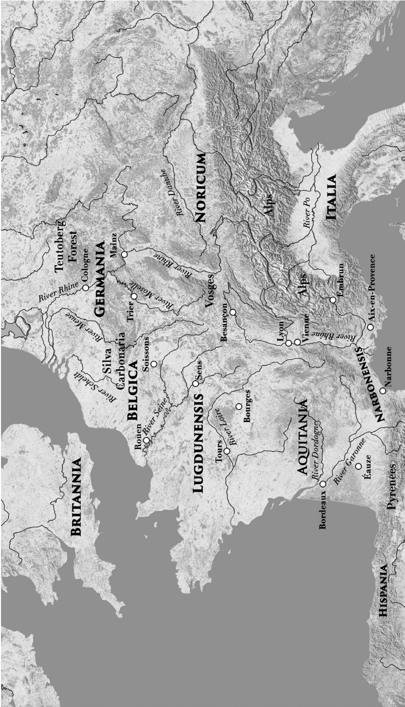
Map 1 Roman provinces and metropolitan cities at the dawn of the Merovingian Age