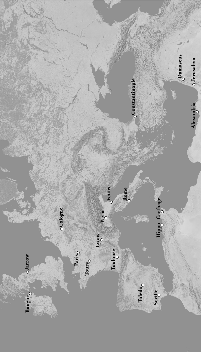
Map 3 The wider Merovingian world