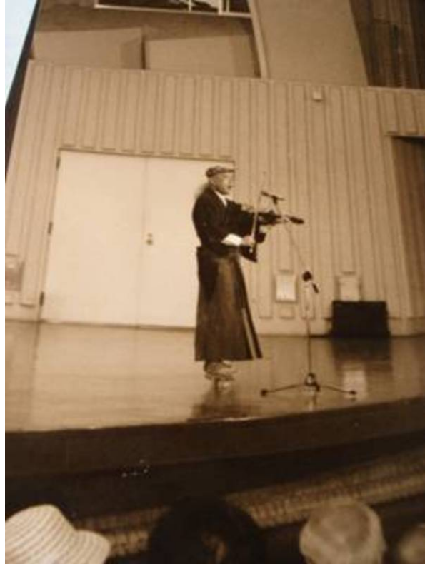
Ueno Park, 1999

“traditions” was relevant, but in a way I had not previously considered.