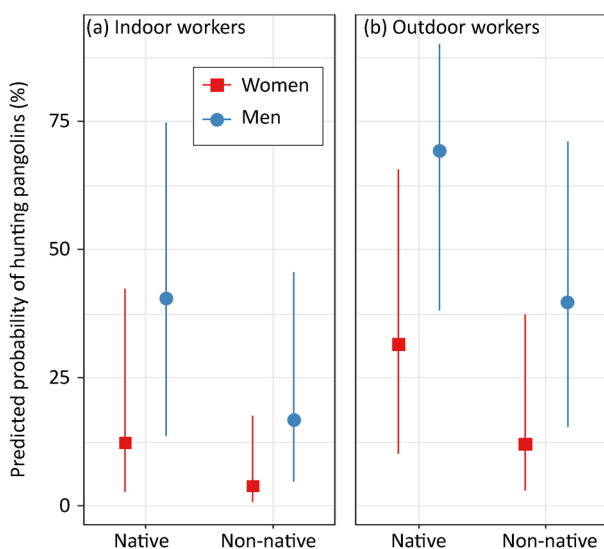
FIG. 3 Predicted probabilities of reporting pangolin hunting amongst survey respondents, taking into account indoor and outdoor workers, native and non-native ethnic groups, and gender.

Scale trade and trafficking chain We identified five households located around Deng-Deng National Park and three near Mpem et Djim National Park that held pangolin scales,