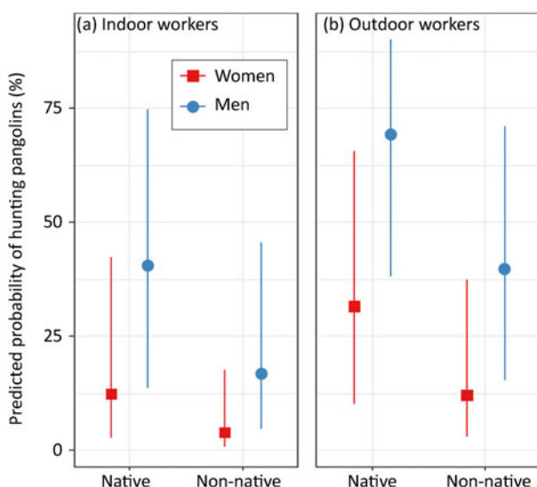
FIG. 3 Predicted probabilities of reporting pangolin hunting amongst survey respondents, taking into account indoor and outdoor workers, native and non-native ethnic groups, and gender.

Scale trade and trafficking chain We identified five households located around Deng-Deng National Park and three near Mpem et Djim National Park that held pangolin scales,