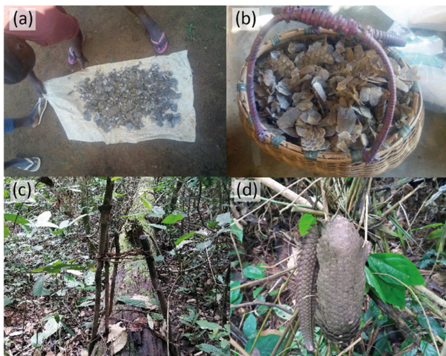
PLATE 1 (a,b) White-bellied pangolin Phataginus tricuspis scales held in local households around Deng-Deng National Park. (c) Traditional trap set on a fallen log targeting white-bellied pangolins. (d) A white-bellied pangolin caught in a traditional trap in Mpem et Djim National Park.

pangolin exploitation in the region. Pangolins are sold openly in wildmeat markets and restaurants in Cameroon despite the presence of wildlife authorities, probably as a result of weak enforcement or ineffective public communication about wildlife-related rules and regulations (Nguyen et al., 2021). Many respondents stated that pangolins were once observed frequently in their communities (Difouo et al., 2020; Mouafo et al., 2021), and, although pangolins were reported as most often being captured < 10 km from settlements, hunting > 10 km away was also reported, which could indicate local depletion.