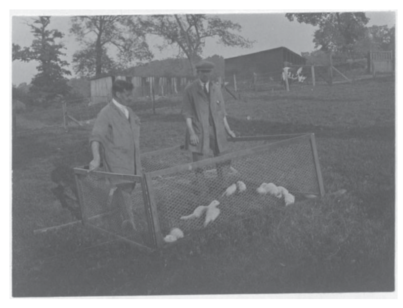
Figure 6. Purpose-bred ferrets at Mill Hill. Date unknown ( c .1924–1926).

Italy, France and Germany, but without purpose-bred animals. Laidlaw and Dunkin reviewed and largely dismissed this early work.<sup>79</sup> Although they were confident they now had the 'right' pathogen, along with the facilities and techniques for its manipulation, they found, as others had before them, that producing virus vaccines was difficult.<sup>80</sup> The key obstacle was the lack of artificial culture media and techniques with which to purify the pathogen. The problem was repeatedly highlighted in MRC and DRC reports, and in the medical press.<sup>81</sup> Virus vaccines had to be produced and standardized at the whole-animal or tissue level, as in the well-established vaccines used for smallpox and rabies.<sup>82</sup> In the 1920s, researchers searched for improved methods for