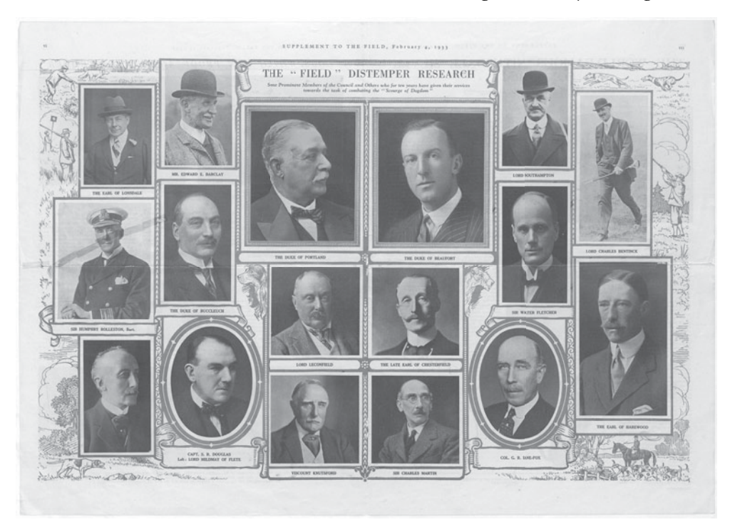
Figure 4. The Field Distemper Research Council, The Field, 4 February 1933, p. 9.

being an avid hunter and outdoorsman who maintained a country home and close relations with the landed gentry.<sup>53</sup> Bringing together representatives from both animal and human pathology, the DRC aimed to establish 'a constant and invaluable interchange of ideas and methods'.