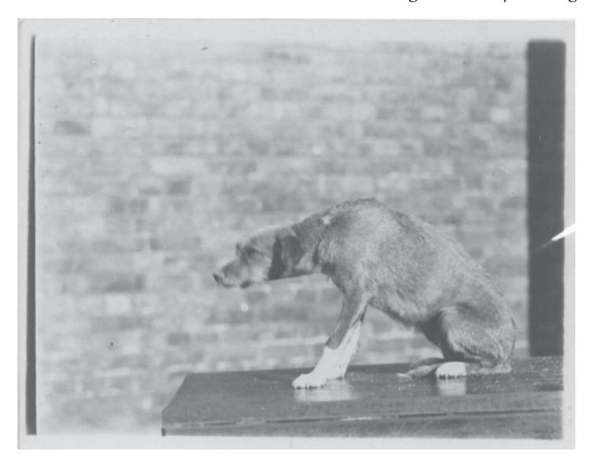
Figure 2. Copeman's Experimental Distemper. 'Day before death', the Lister Institute, 1900.

In Britain, veterinary investigations into controversies surrounding the aetiology of distemper and the value of vaccines raised questions about the role government might play in their resolution. The limited work of the 1903 committee made it clear that the veterinary profession lacked resources and expertise to study the disease. Recognizing this shortcoming, John M'Fadyean, president of the Royal Veterinary College (RVC), joined with a group of influential patricians, headed by the Duke of Beaufort, to propose the creation of a new Committee on Distemper in Dogs under the Board of Agriculture and Fisheries.<sup>23</sup> Patricians were important in this venture. They had significant social capital at their disposal to get their interests onto government agendas and linked their hereditary privilege with a sense of moral duty to the nation. The Duke of Beaufort chaired a group that included Lord Leconfield, a keen huntsman, who opened Petworth Estate to the public and donated Scafell Pike to the National Trust.<sup>24</sup> The government refused to fund its work, which led the committee to seek