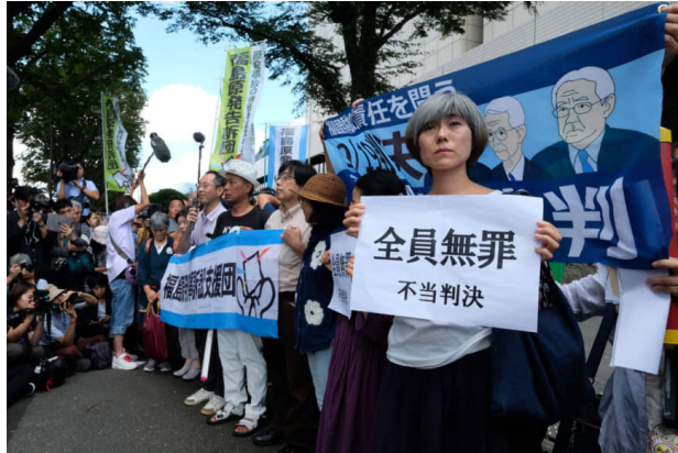
After the TEPCO Trial acquittals on September 19, 2019, a woman outside Tokyo District Court holds up a sign saying “All Acquitted: Inappropriate Judgment.”

The outcome of the TEPCO trial also raises an interesting question: what if the trial had occurred before a lay judge panel of six citizens and three professional judges? This did not happen in the TEPCO case because under Japan’s Lay Judge Law, the only crimes eligible for lay judge trial are those for which the maximum possible punishment is a life sentence or a death sentence (only about 2 percent of Japanese crimes fall into these categories). But what if?