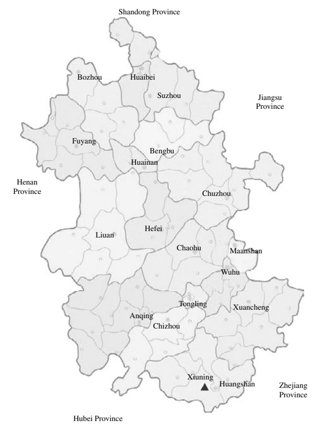
Fig. 1. ( a ) Map of Wannan wildlife first-aid centre. The numbers in the map indicate the rearing sites for different animals. 1, Rearing cages or pens for Asiatic black bear, red dog, porcupine, grey wolf, clouded leopard, rhesus macaque and stump-tailed macaque. 2, Rearing cages for red-crowned crane, silver pheasant, crowned crane, white crane and cassowary. 3, Rearing pens for tufted deer, Reeves' muntjac, yak, water buffalo, and black muntjac. 4, Rearing pens for green peafowl and ostriches. 5, Rearing pens for Sika deer and David's deer. 6, 7, 8, Decentralized rearing area for deer. ( b ) Map of Anhui Province. The solid triangle shows the locality of Wannan wildlife first-aid centre.

able to obtain only a single sample from each, because of technical difficulties (e.g. ensuring the safety of animal handlers). Similarly, the birds reared at the lake were not sampled. All the samples were converted to 10% (w/v) suspensions in PBS (0.01 M, pH 7.2-7.4) immediately following the sampling. Finding the existence of HEV RNA in the animals' faecal samples, we contacted all seven workers including a veterinarian and six feeders in the centre and collected serum samples from them in December 2006. All human study subjects provided informed consent. These samples were shipped, frozen, to our laboratory and stored at -30 °C prior to analysis.