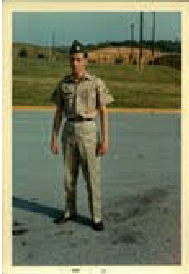
The author at the 137th Ordnance Company, Henoko, Okinawa, May, 1968.