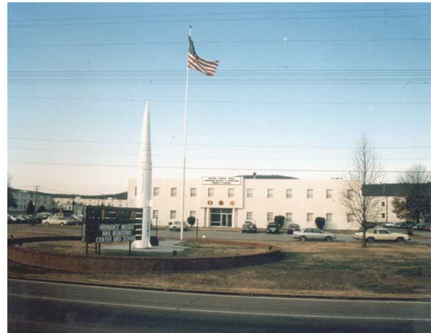
Headquarters Building, Redstone Arsenal, Huntsville, Alabama

I arrived by bus at night in Huntsville, Alabama, nicknamed "Space Capital" and "Rocket City." In those days it was a center of the U.S. space program, beginning with development of the Redstone rocket and later the Jupiter-C launcher that carried the first American satellite, the Explorer, into space in January, 1958. This followed a number of spectacular lift-off failures on national television that underscored America's lag in the space race with the Soviet Union which had successfully launched Sputnik in 1957.