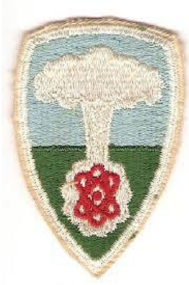
Defense Atomic Support Agency shoulder patch.