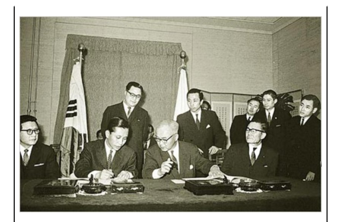
Korean Foreign Minister Lee Tong-won (left) and Japanese Foreign Minister Shiina Etsusaburo (right) sign the 1965 Treaty establishing ROK-Japan relations.

But has this in fact contributed to peace and stability in East Asia? Researchers have concentrated their attention on the harmful acts of Japan in the first half of the century, and have given scant attention to the self-restraint and the efforts on behalf of peace by Japanese in the second half of the century and in the new millennium. As a result, in neighboring countries, Japanese people today are often seen to be the same as the Japanese of the imperial era. They tend to be viewed as a constant threat. At the same time, not a few postwar Japanese people who have learned from experience and not once gone to war are surprised at this view from their neighbors and feel powerless to respond to this neglect of their own efforts at peace. Research into the history of the first half of the twentieth century was carried out with the expectation it would guarantee peace, but it is hard to say that it has contributed to reconciliation between the Japanese and their neighbors. Without efforts toward reconciliation on both sides, such research can in fact function to support further conflicts and bad feelings between Japan and its neighbors.