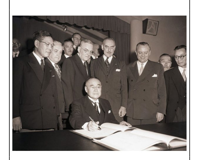
Prime Minister Yoshida Shigeru signs the US-Japan Security Treaty, March 8, 1951, with John Foster Dulles and W. Averill Harriman looking on.

accumulate and fester. The reason people can sustain an ordinary social existence is that methods do exist to recognize crimes, apologize for them, and make compensation. The situation at the state level is the same. In the case of twentieth century Japan, the Tokyo war crimes trial, the peace treaty of 1952, as well as the treaties and joint declarations with the Republic of Korea and the People's Republic of China were rites of passage for Japan's return to international society. These were possible only with the premise of making clear the responsibility of the leaders of the Asia-Pacific war and punishing them. However sloppy the proceedings at the Tokyo war crimes trial, to deny its outcome is to destroy the foundations of the restored international relations. If someone nevertheless ventures to do this, one cannot forget that the former victims would gain the right to retaliate.