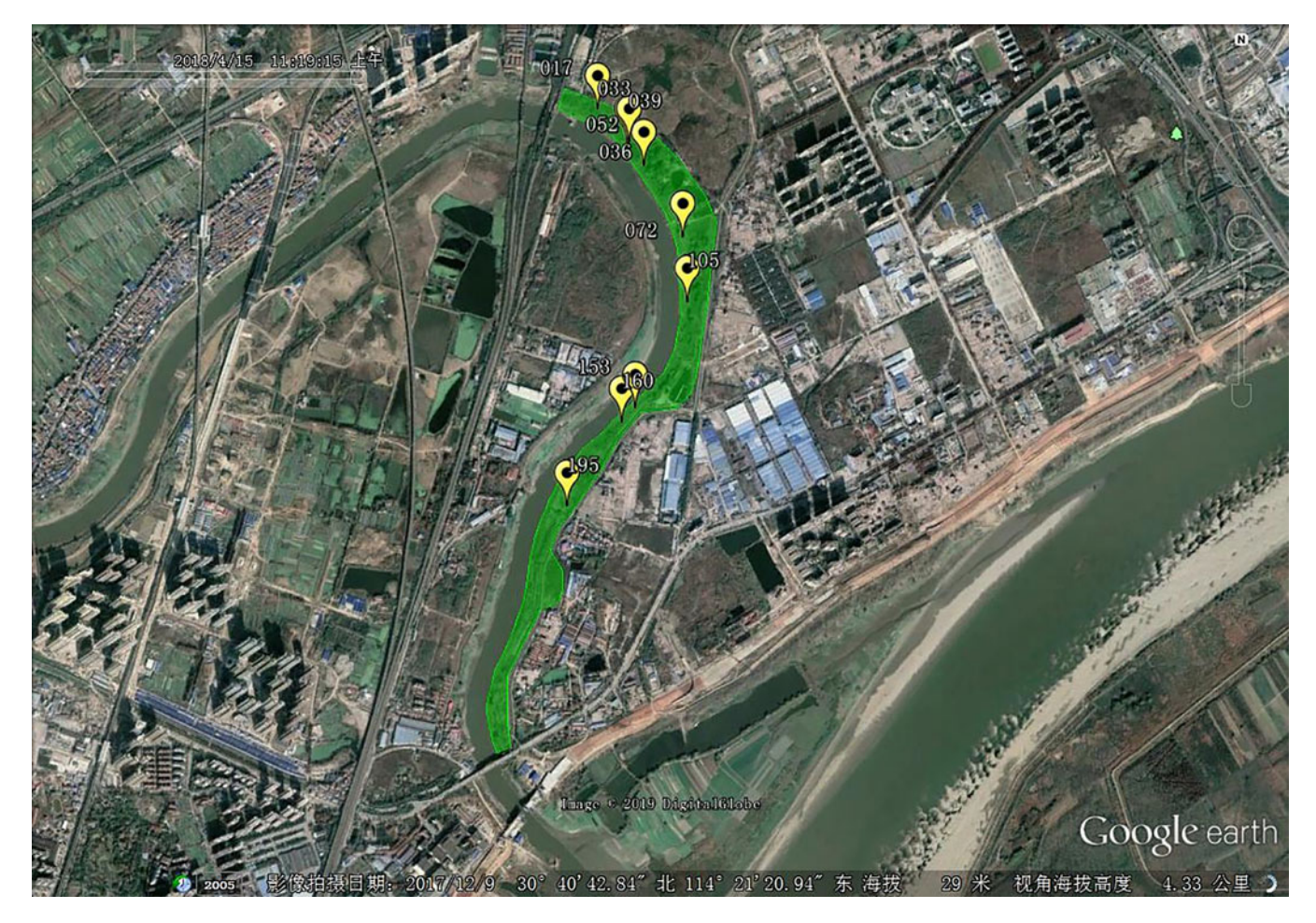
Fig. 2. Snail points in research site in spring 2018. Green shaded area is the research site and the yellow marks are the survey units with living snail(s).