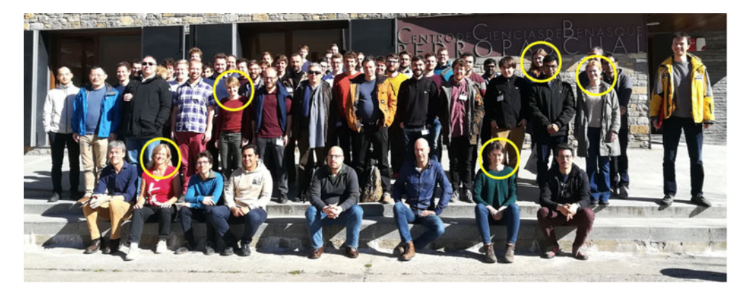
Figure 1. Typical low participation of women in physics conferences (yellow circles), for example at the Workshop on Entanglement in Strongly Correlated Systems, Benasque, Spain Feb. 2020

from being protagonists in decision and policy making. Few exceptions confirm the rule and men continue to dominate the field.