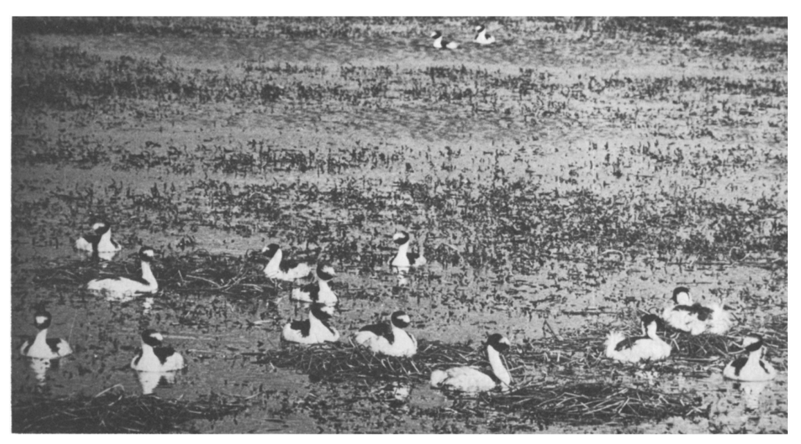
Hooded grebes in Argentina-research is needed (Francisco Erize).

In the review of Save the Birds ( Oryx , 22 , 61) the ICBP (International Council for Bird Preservation) was referred to as the International Council for the Protection of Birds. We apologize for this error.