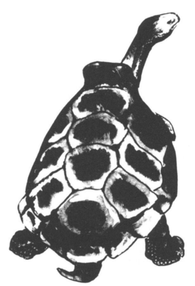
A giant tortoise from the Galapagos Islands (Hilary Bradt).

In December 1987 Suriname's Minister Briefly