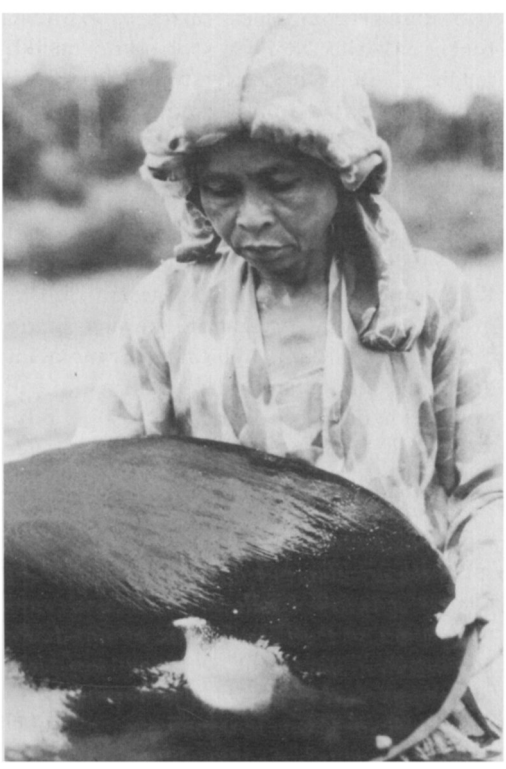
Dayaks of Muara Joloi pan gold in a sustainable manner, exploiting sand bars along the Barito river where new gold dust supplies are deposited during floods

At Barito Ulu scientists are investigating how frugivorous animals that disperse seeds help regenerate selectively logged rain forests. It has already been shown that the relative