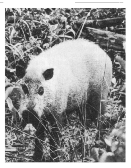
The bearded pig is the most abundant ungulate at Barito Ulu and is often seen in the riverine forests. They are important dispersal agents for rain forest fruits and play an essential role in forest regeneration. They are also important for subsistence hunters and a management programme is needed to avoid overexploitation ( Richard Bodmer ).

Other primates seen at Barito Ulu include the long-tailed macaque Macaca fascicularis at