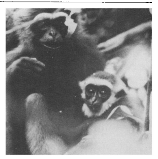
At Barito Ulu lies endemic Bornean fauna meet with the immigrant fauna of Sumatra. The best example of this faunal mixing is the hybridization between the Bornean gibbon and the agile gibbon. The latter species is shown above ( Richard Bodmer ).

the lowering of the tree line on the central mountain chain. The same glacial period connected Sumatra and Borneo by a land-bridge and enabled many 'mainland' species to invade south-western Borneo. When climatic conditions improved populations of both faunas expanded until they met the formidable barriers of the Barito and Kapuas rivers. The smaller headwaters of these rivers, such as Barito Ulu, enabled many species to cross the barriers and mix with related fauna.