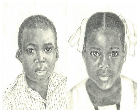
Figure A1. Sample stimuli from the Face-Name Binding Test (FNBT).

When designing the overall cognitive test protocol, we selected NEPSY-II subtests to assess the convergent and divergent validity of GLAMS subtests. Given the limited attention spans of preschool children, we prioritized subtests that were quick, simple to administer across various contexts (clinics, schools, homes) and considered culturally appropriate by Grenadian members of the study team. To assess convergent validity, we considered all of the preschool memory domain subtests from the NEPSY-II. There were concerns raised about the cultural familiarity and administration time/burden of the Narrative