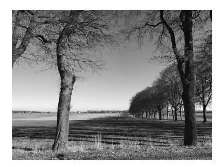
Figure 12.1 Typical landscape in the Veenkoloniën.

(Smit and Jager 2018). Consequently, the region largely relies on starch potato production in a 1:2–1:3 rotation,<sup>1</sup> with starch potato being rotated every second or third year with mainly sugar beet and wheat. Although starch potato has been the most profitable crop in the region,<sup>2</sup> such a tight crop rotation increases the risk of plant parasitic nematodes. Yet, extending crop rotation to control for nematodes risk is challenging, as current price margins are already low. With an estimated net present value per hectare of arable land of 2,541 €/ha (Diogo et al. 2017), the region ranks amongst the least profitable in the Netherlands. Most farms are specialised either on arable crops or livestock; we focus on the former. There are a number of cooperatives operating in the region – Avebe (starch potato), Cosun Beet Company (sugar beet), Agrifirm (wheat processor and feed supplier) – yet we only consider Avebe as a part of the farming system, since Avebe depends on farmers in the Veenkoloniën for the supply of food