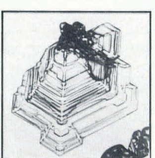
Fig. 2. Examples of grains collected from natural snowpacks and observed after several weeks' storage in cold iso-octane.