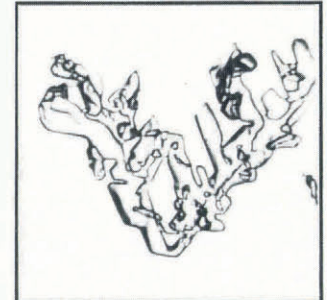
Fig. 4. Grains collected directly in iso-octane from a snowdrift.