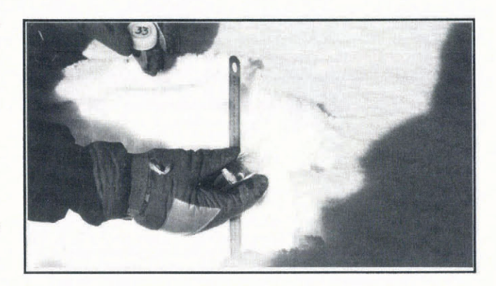
Fig. 1. Operator collecting snow samples in the field in an iso-octane flask.

After having made a snow pit or at a snow-cover