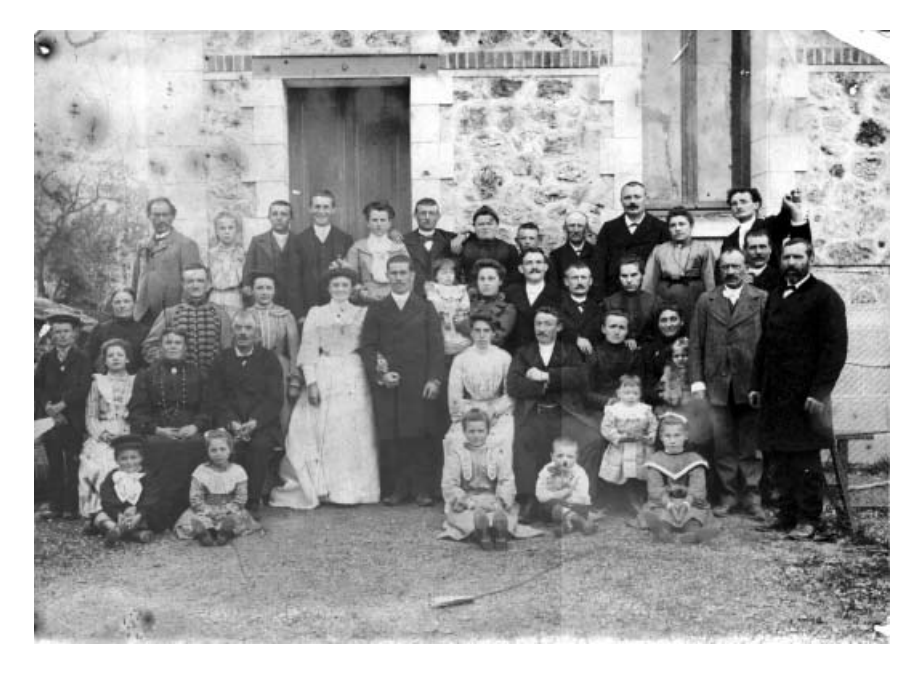
Figure 1. Portrait of a marriage in Oeuilly (Marne), 1905. Bride, groom, their parents, and relatives all lived in three villages situated five kilometres from one another. They were farmers or farm workers.