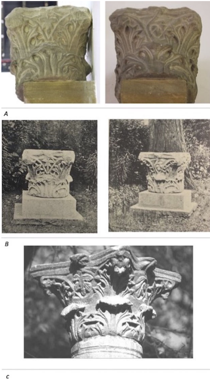
Fig 3. Lyre Capital from the Blachernai area and comparisons. A) Lyre Capital, Blachernai area, Constantinople, 5th-6th c., Lower Kingswood (Surrey), Church of the Holy Wisdom of God; B) Lyre Capital from the Blachernai area as it appears in Freshfield's Memorandum (1903); C) Lyre capital, 5th-6th c., Ayasofya courtyard (after Guiglia, Barsanti, Paribeni 2008).