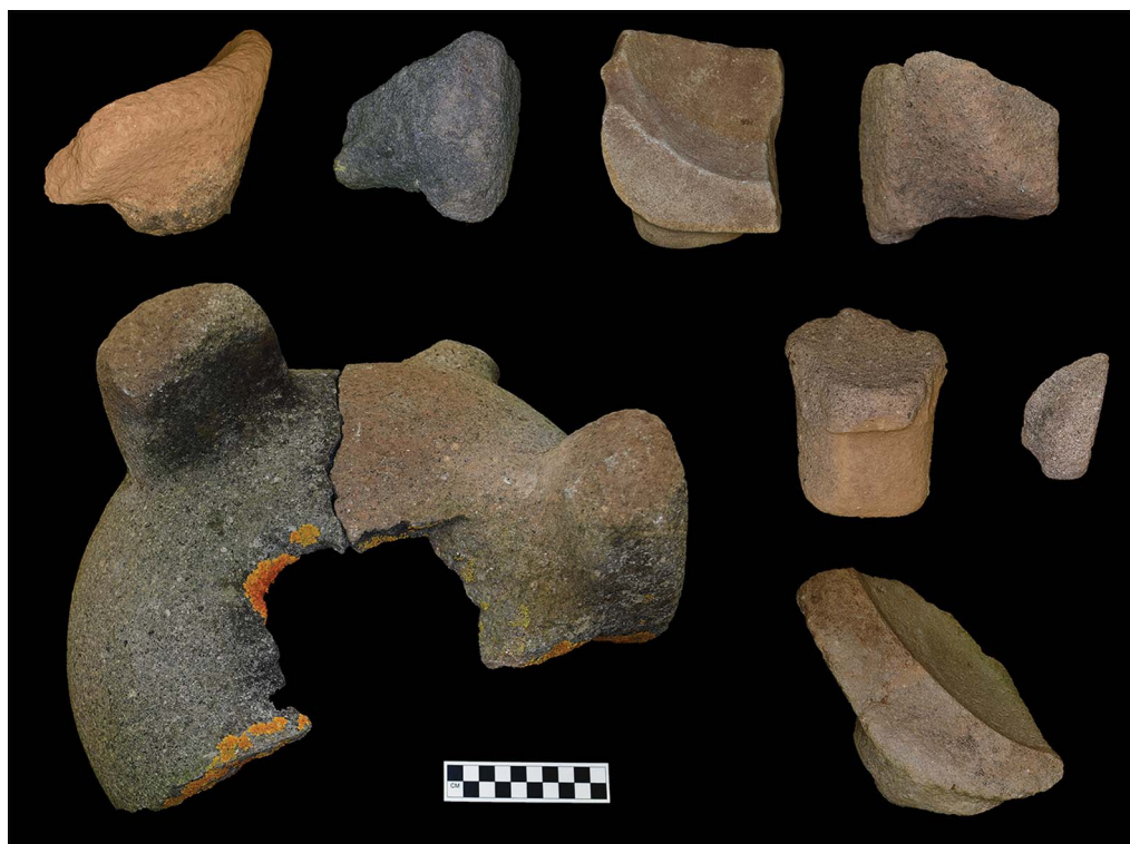
Figure 4. Tripod mortar fragments from Raftis.

during volatile times. Yet it seems that, for Porto Rafti's inhabitants, the islands also offered another advantage: immediate proximity to maritime routes (Kramer-Hajos 2016: 174–78). These stretched north to the Euboean Gulf, east through the Cyclades to western Anatolia and Cyprus, and south towards the Peloponnese, as the distribution of White Ware indicates (see Figure 6). Here, we would like to suggest that the crucial factor in this community's success may have been its possession of wide-ranging practical knowledge related to both the crafts practiced in Porto Rafti and an ability to distribute the resulting products through maritime networks.