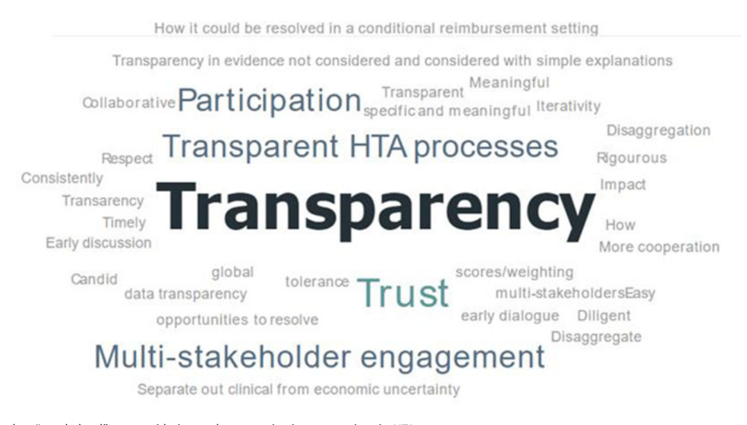
Figure 2. GPF member "word cloud" on considering and communicating uncertainty in HTA.

of trial design and outcome measurement to better clarify some of the uncertainties facing HTA agencies.