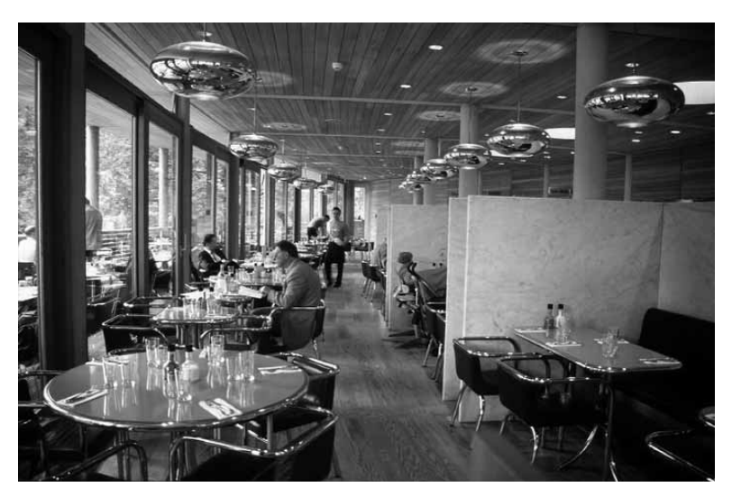
Hopkins Architects, 'Inn the Park', St. James's Park, London

The decision of the architect of 'Inn the Park' to prioritise aesthetics above 'any' environmental consideration demonstrates a lack of holistic design, conviction and commitment to a fully sustainable remit. Could it be that Hopkins have compromised a lot because they do not have a strong enough ecological agenda to which they are committed? Even with a deficit of