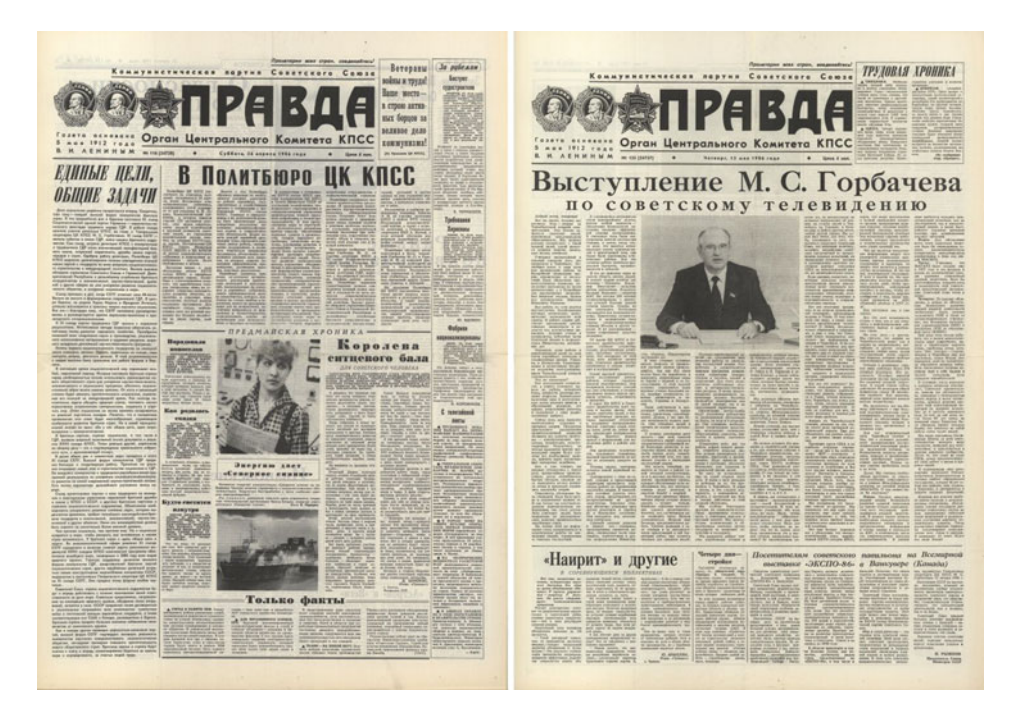
Figure 7. Cover of Pravda newspaper, April 26, 1986, day of the Chernobyl nuclear accident and cover of Pravda newspaper, May 15, 1986. Nineteen days after the accident at Chernobyl, President Mikhail Gorbachev made a television address to the Soviet people.

In relationship to Heba's point vis-à-vis history, I was thinking about Harun Farocki's film Images of the World and the Inscription of War (1988) and the image of the Auschwitz concentration camp that was captured incidentally at an aerial flyover as part of American surveillance efforts. It is not until the 1970s that the image is discovered and its significance is realised. I think that there are a lot of images whose full potential to speak back to certain histories operates as a latency that is not yet fully recognised. Some of the image practices in Palestine documenting daily life under occupation form part of this visual archive that is being produced for a future in which there might be some mechanisms of accountability or legal frameworks where this documentation would speak to the coercive state practices that govern the everyday mobility and life worlds of Palestinians. There are many photographers producing images that are