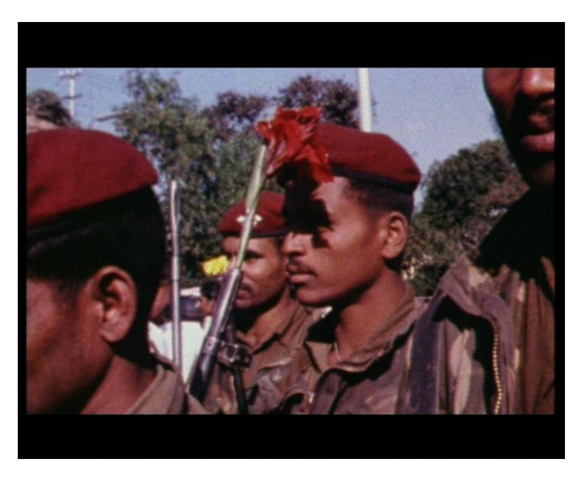
Figure 6. Newsreel footage of Indian soldiers entering Dhaka, December 1971; scene from Muktir Gaan (1995 dir: Tareque & Catherine Masud).