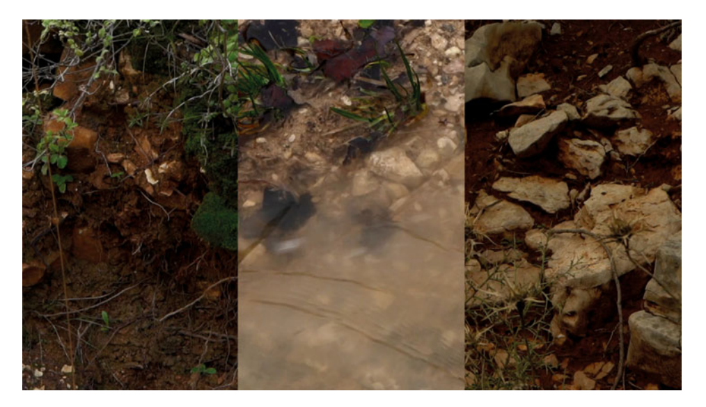
Figure 2. Helene Kazan, Frame of Accountability: (Un)Touching Ground, 2022. Digital film still.

(Un)Touching Ground engages a decolonial archival practice to create what I term as legal fiction, activating feminist and artistic methods towards a wider engagement in international legal justice. This particular episode traces the human and non-human effects of these events to undo a temporal-spatial distance constructed in distinguishing this violence as environmental and conflict-based. It, literally, follows the roots of the violence and the three directions of the attacks through Lebanon. Rather than showing a colonial map, I bring the audience to touch the ground in an embodied experience of that space.