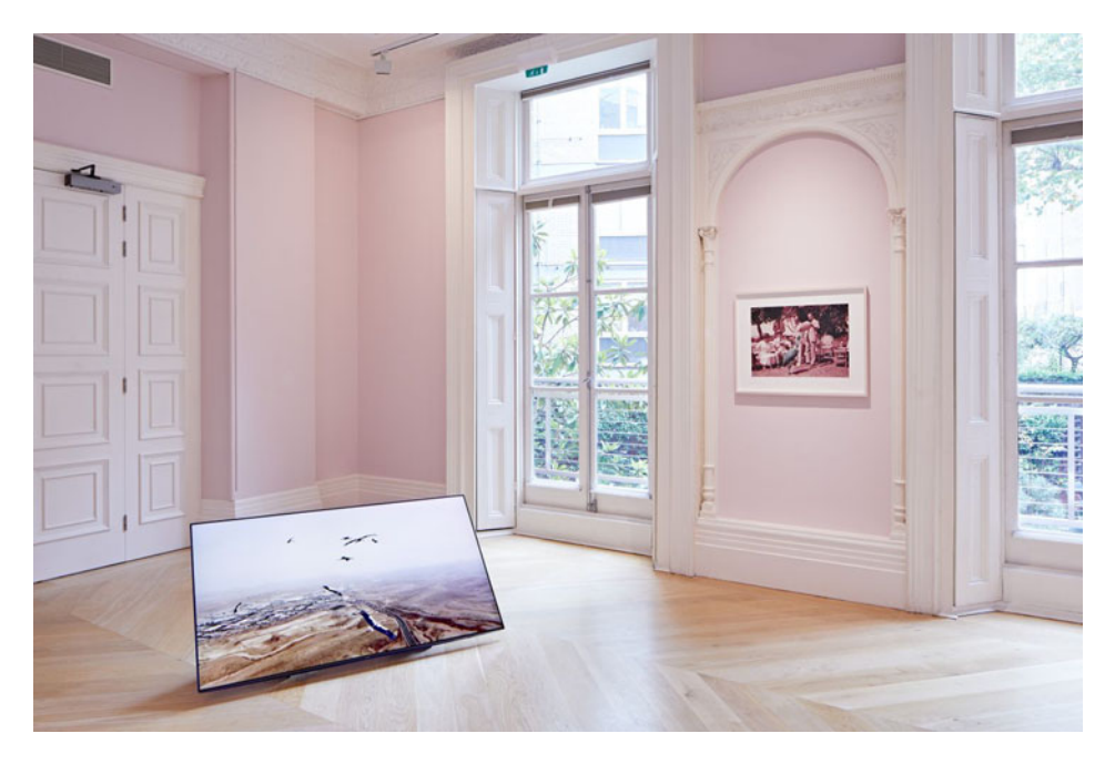
Figure 9. Heba Y. Amin, The General's Stork, 2020. Installation at The Mosaic Rooms, London, 2020/2021.

meaning transformed through digitisation, specifically where memories are encapsulated in the material realities of the digital and thereafter generated or accumulated through processes of deterioration?