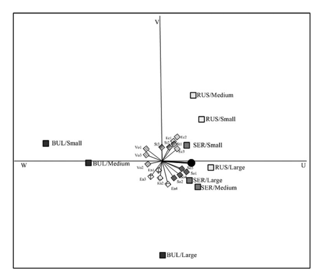
Figure 3. GAIA plane.

certain extent. During the ranking, the grouping according to the size of the company was not obtained. The analysis of the obtained results pointed out the differences in the attitudes of employees where the highest significance of CSR was given by the employees from large companies operating in Russia. The latter is explained by the fact that large companies operate internationally and easily accept global business trends. Moreover, their business is more exposed to the control of public opinion and institutions. Russia belongs to the BRIC (Brazil, Russia, India, China) group of fast growing economies, therefore, the position and economical influence of Russia in the world economy is constantly increasing. Business sector empowerment and ambitions of Russian companies to operate at foreign markets will continue to motivate more profound engagement in all aspects of socially responsible behavior.