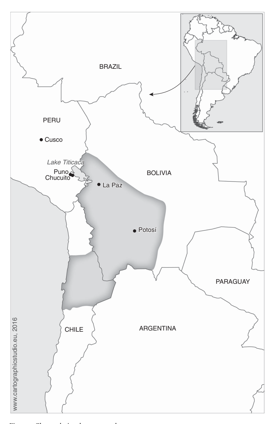
Figure 1. Charcas during the seventeenth century.