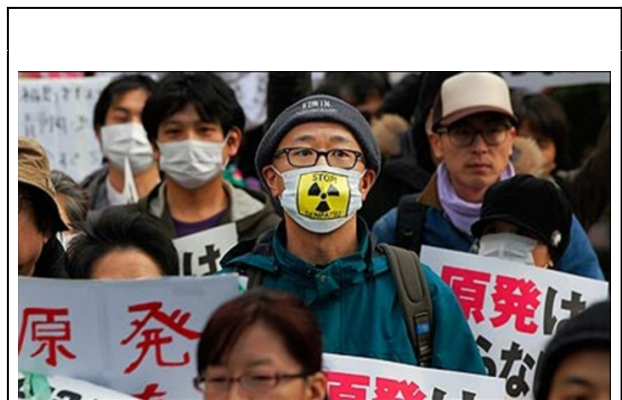
Protestors demonstrated against nuclear power in Tokyo on Sunday, as officials admitted the crisis at the Fukushima Daiichi nuclear plant could take 'months or years' to be resolved.