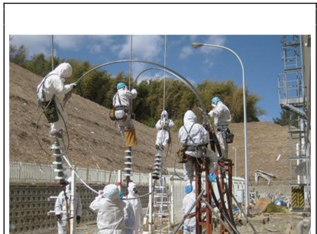
Contract workers doing repairs

Those who answer these offers may have little awareness of the dangers and they are likely to have few other job opportunities. $122 an hour is hardly a king's ransom given the risk of cancer from high radiation levels. But TEPCO and NISA keep diffusing their usual propaganda to minimize the radiation risks.