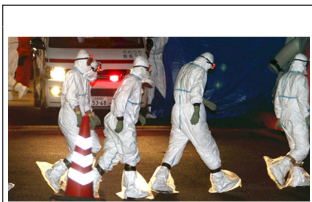
Radiation protective uniforms but not boots. Two TEPCO workers were hospitalized after stepping in radioactive water.

As early as the mid-1970s, the use of subcontracting labor in the nuclear industry was well established in Japan. In France, this trend would develop after 1988, reaching a rate of 80% by 1992. According to NISA's data, in 2009, Japan's nuclear industry recruited more than 80,000 contract workers against 10,000 regular employees. The initial goal was not necessarily to hide the collective dose, but to limit labor costs. But the fact is that whether in France or Japan, the nuclear industry nurtures a heavy culture of secrecy concerning the number of irradiated workers. As far as we can know, based on the figures published by the Ministry of Health and Labor, before Fukushima's catastrophe, only 9 former workers received compensation for an occupational cancer linked to their intervention in nuclear plants. 5 This number is probably very far from the reality of the victims, given the number of workers exposed, and the numerous opacities of that system beginning with the fact that TEPCO and other electric power companies have always refused to disclose the list of their subcontractors.