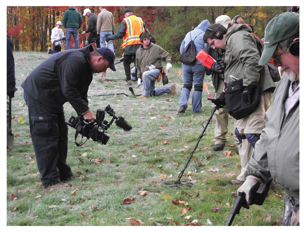
FIGURE 1. Avocational detectorists beginning their survey lanes at Bennington Battlefield.

Labels can get in the way of building collaborations, and the archaeologist's goal should be to not offend anybody.