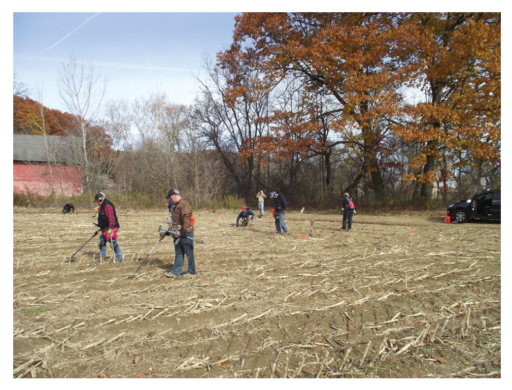
FIGURE 3. Volunteers using corn rows to assure full coverage, Bennington Battlefield.