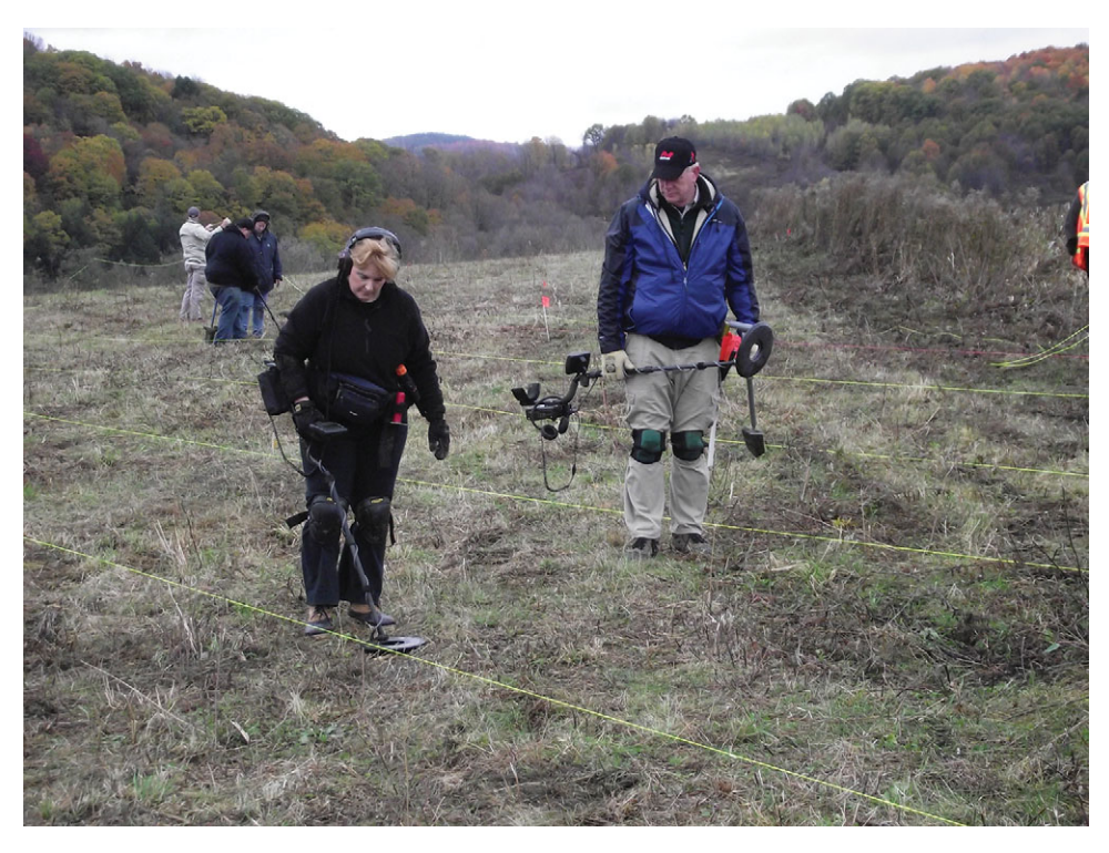
FIGURE 2. Survey lanes help assure controlled coverage, Bennington Battlefield.

a cofounder and an instructor for AMDA. During two weeks of field research, CHG designated four weekend days when avocational detectorists could assist in the research on state-owned portions of the battlefield. We required preregistration and limited an individual to participating on only one of the four days. Fifty-four avocational detectorists participated, with some driving more than four hours, one way, to attend. The goal was to have no more than four avocationalist detectorists per professional archaeologist. The following discussion is drawn from our report on the Bennington research (Selig et al. 2016).