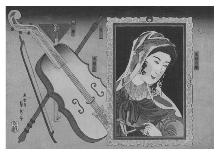
Figure 1.3 Utagawa Sadahide, Female Foreigner with Western Instruments (woodcut). Utagawa Sadahide (歌川 貞秀, 1807–c. 1878/1879) was a Japanese artist best known for his Yokohama-e pictures of foreigners

of Empire, but also to a more general discussion of European modernity versus non-European civilisations.