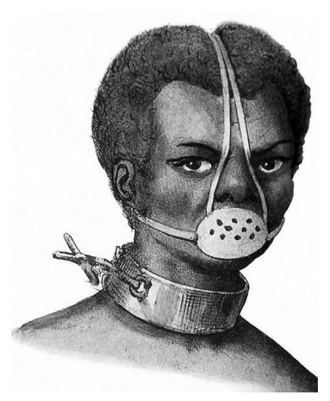
Figure 1.2 Jacques Arago (sketch), Châtiment des esclaves (Brésil) . Bibliothèque nationale de France

In his Souvenirs d'un aveugle, the author explicitly refers to the striking contrast between the beauty of the local landscape and the cruelty of slavery, a cruelty that is represented in many of the works he painted in Brazil, in which he frequently depicts the punishment of slaves. <sup>4</sup> As shown in his Castigo de Escravo (1839), the punishment of slaves also included the covering of their mouths. Although slaves were usually allowed to sing, and in some cases were even made to perform in choirs and orchestras, the depiction in his famous drawing from Rio almost seems intended to highlight this irony in its juxtaposition of a European style opera house with local slaves (see Figure 1.2). Further complicating the situation, as the