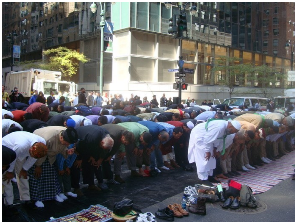
Muslims gather for prayer in New York City streets

One year after the New Jersey suit was filed, a separate action was filed in federal district court in Brooklyn on behalf of Muslim residents of New York City. Named defendants included then-Mayor Michael Bloomberg and Chief of Police Raymond Kelly. The plaintiffs included a community college student who organized a food program infiltrated by an undercover police agent and the imam at a mosque who said he was repeatedly questioned by undercover police officers. Both men, Muslim residents of Brooklyn, claimed that fear of the presence of undercover police forced them to reshape their words and actions in order to avoid potential conflict or misunderstanding by police informants and drove potential members away from their groups.