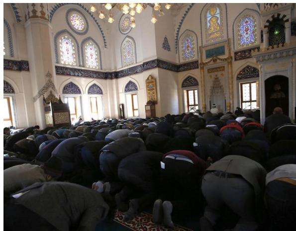
Muslims pray in Tokyo mosque

According to the court, the Tokyo Metropolitan Police launched their campaign with the formation of a “mosque squad” composed of forty-three agents in June 2008. The leaked documents showed that police stationed agents at mosques, followed individuals to their homes, obtained their names and addresses from alien registrations, and compiled databases profiling more than 70,000 individuals. The documents also showed that the police obtained bank account information, including balances, income and expenses, and other personal information and stationed agents at Islam-related non-profit organizations, halal shops and restaurants, and other places that might be frequented by members of Tokyo’s Muslim community. In some cases, the police actually installed surveillance cameras at mosques and other venues.