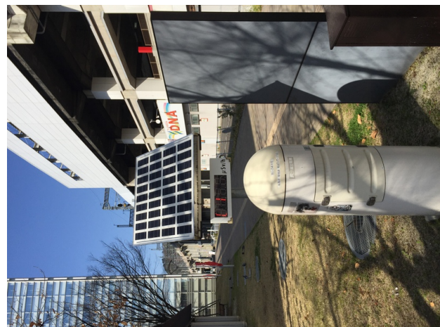
Fig. 2: Fixed station radiation monitor post.

All of us have been dealing with the horrors and the terrors of the COVID-19 pandemic since early 2020. Viscerally, we feel the anxieties and fears that accompany uncertainty about dire risks to our lives and loved ones. Being cautious about our public activities in the age of COVID makes intuitive sense. We navigate our potential exposures, work to mitigate our potential contaminations, and worry endlessly about loved ones with health concerns. Each small, unrelated medical symptom a family member exhibits is met with anxiety. This is a reality for people worldwide. Those who live in areas dense with radionuclides face similar anxieties: the locations of the risk are indeterminable; who is being exposed and who is safe is unclear, even while the damage is inflicted; daily life is rife with anxiety. But in radiologically contaminated communities it is not conspiracy theorists on social media dismissing them as irrational, it is state health officials. They draw maps, based entirely on externally measured levels of radiation, and use those maps to tell people to move back to villages where the levels of contamination are “acceptable,” to send their children to schools and move back to towns where the presence of radioactive particles is not dense enough to register on Geiger counters placed high above the ground.