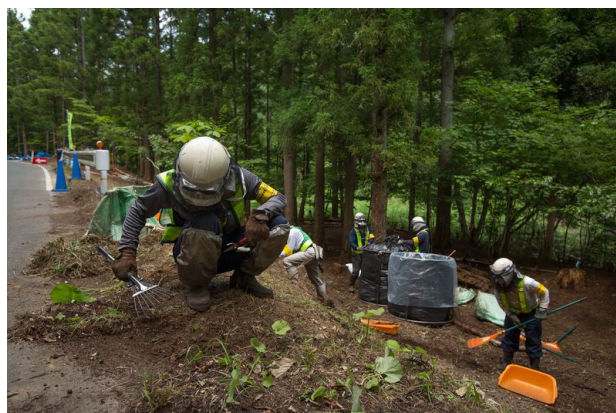
Fig. 3: Decontamination crew works to decontaminate a roadside in Iitate in 2015.

Almost certainly the particles in the forest canopy and on the trees will re-contaminate this roadside within a year.