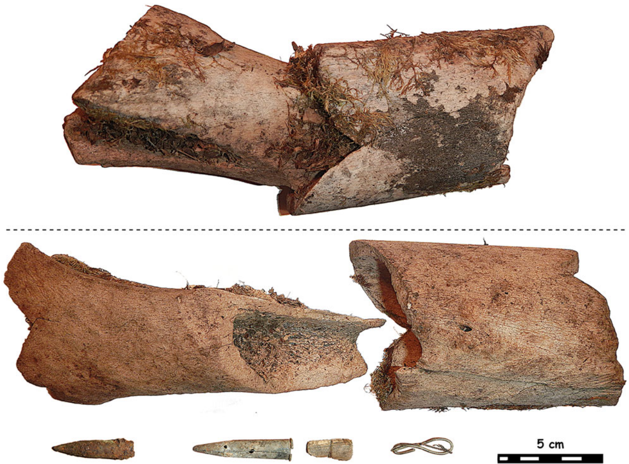
Figure 4. Top: Conjoined pieces of cattle bone found on top of a PoW rubbish dump. Bottom: The underside of the bones, and the items found concealed inside them: a bullet, a metal cylinder and a wooden cork that capped it, and a knotted electrical wire found inside the cylinder.

to intimidate the Germans. Notably, the star is upside-down for a Soviet star and also has the inner lines carved within the star, thus resembling the pentagram symbols used in traditional folk magic.