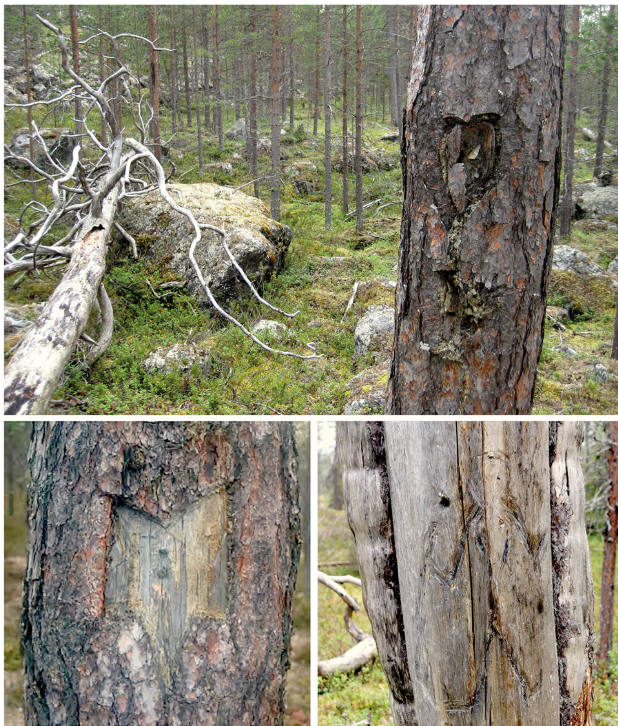
Figure 7. Top: Heart carved into a pine at the Kankiniemi PoW camp. Bottom left: 'Partisan star', a pentagram carved on a pine along a German-built wartime Kopsusjärvi track in Sodankylä, with a bullet hammered into its centre.