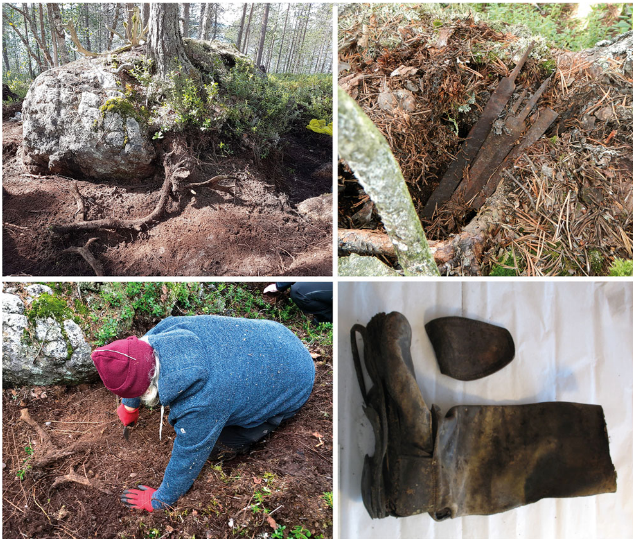
Figure 3. Selected features documented around the boulder at Hyljelahti. Top left: Reindeer antlers on top of the boulder and three more antlers entangled with the tree roots being excavated at the base of the boulder. Top right: Four files found in a bundle under the turf below the antlers on the top of the boulder. Bottom left: Iain Banks uncovering the three antlers and the German military jackboot that covered the antlers at the base of the boulder. Bottom right: The German jackboot excavated by the boulder, after conservation.

as paint cans, look like casual dumping of rubbish. Whether or not there is a direct link here, the non-casual depositing echoes traditional Sámi sacrificial practices at sieidi sites. There is a long history of ‘spiritual engagement’ with the environment and various landscape elements in northern Fennoscandia, sometimes involving depositional practices, from prehistory to modern times, and not only among the Sámi (e.g. Äikäs 2015; Herva & Lahelma 2019). Several features of the Hyljelahti boulder have connections with finds and features from some other sites in Lapland that relate to the folkloric traces of the German military presence in WWII. Overall, we