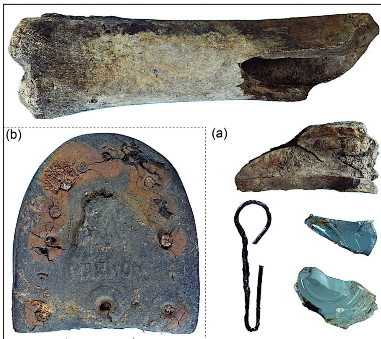
Figure 5. Finds uncovered at the base of the Taavetti Lukkarinen hanging-tree. (a) The bone and the finds concealed inside it; (b) The shoe sole that capped the bone deposit. (Illustration: Emilia Jääskeläinen. Ikäheimo & Äikäs 2018, 102.)

have been an important and valued sacrificial item throughout much of the history of the Sámi sieidi , attested by sources since the sixteenth century (Olaus Magnus [1555] 1998). While the boulder at Hyljelahti is not a sieidi , this comparison helps to put the site in a broader historical context of northern human–environment relations, instead of regarding it merely as an isolated curiosity.