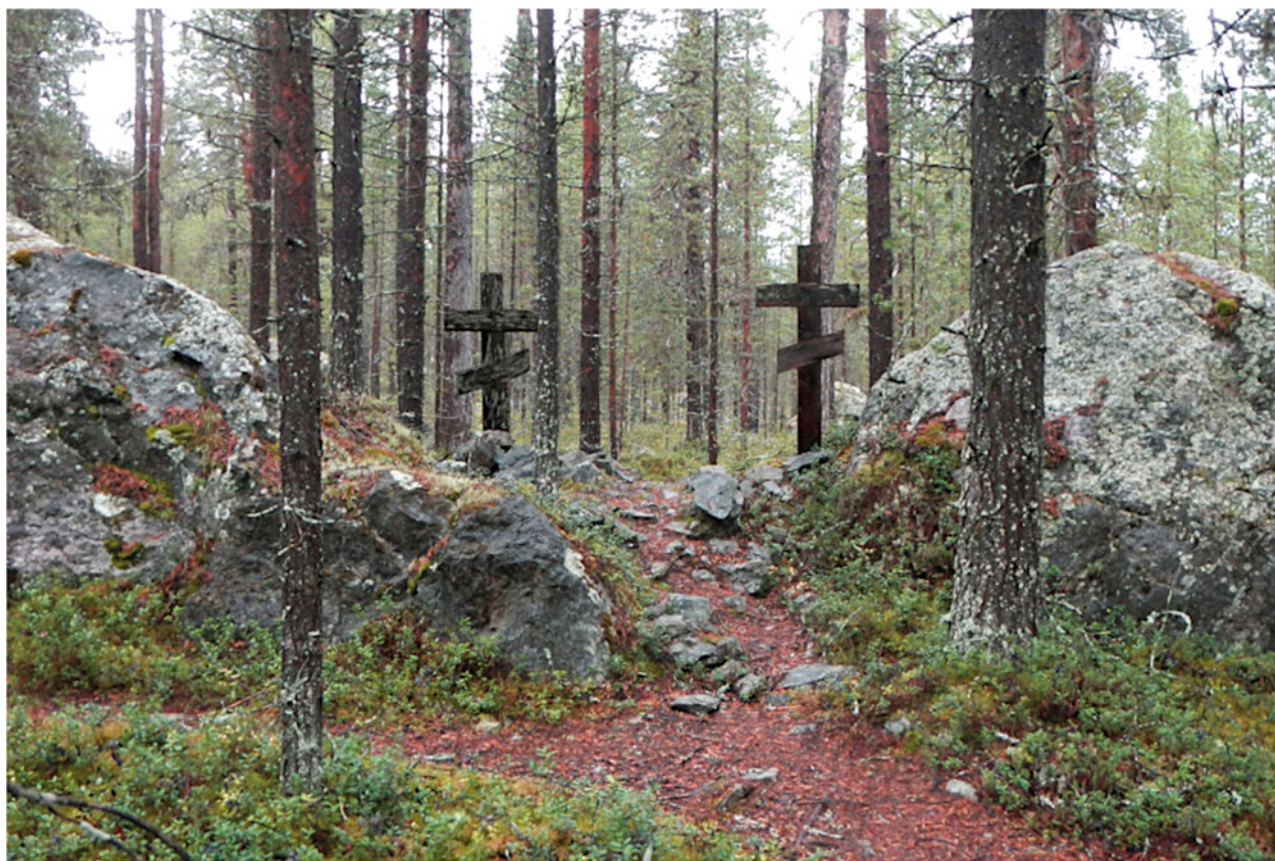
Figure 9. Orthodox crosses in a gate-like setting on both sides of a path leading to a PoW mass grave on the boundary of a PoW camp at Inari Martinkotajärvi.

sites and their impact on people need to be understood. These sites with their various materially and perceptually ‘strange’ features can stir up ‘existential’ reflections about people’s relationship with the surrounding world, as well as the relationships between the past, present and future, as exemplified by the haunting experience of our volunteers at Kankiniemi. The elusive ruins of German sites bring the wartime and its many troubling legacies close to people and force them to face the past in an unmediated manner. This is, conceivably, an important reason why they provide a suitable and powerful ‘infrastructure of haunting’ (Holloway 2010), and thus provoke ghostly experiences and narratives in a landscape that is historically, culturally and experientially ‘fit’ for such experiences.