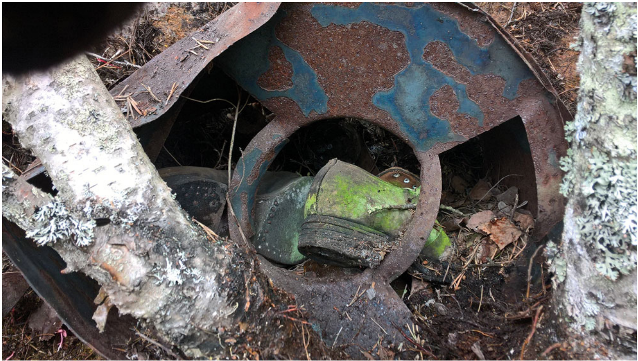
Figure 8. Women's shoes placed inside a wartime stove.

of PoWs and their harsh treatment, which disturbed local people, and perhaps explains why PoW camp sites have a particular 'haunting potential', with memories and places becoming entangled so as to make them experientially disturbing.