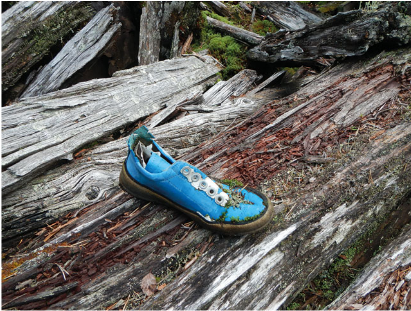
Figure 6. Post-war child's shoe found wedged under the corner logs of a PoW log house at Inari Haukkapesäoja.

which also takes us back to Haukkapesäoja that produced the child's shoe placed underneath the corner of a PoW house and the 'bone bundle' from the PoW dump at a border of the camp. If Ikäheimo et al. (2016) are correct in their interpretation of the Oulu memorial site, the bone bundle from Haukkapesäoja could be interpreted as an analogous 'spirit trap', intended to pacify a locally ill-reputed site. The shoes from Hyljelahti and Haukkapesäoja echo a different but related folk tradition, in which shoes have been assigned special cultural meanings due to their 'liminal' character. Shoes are artefacts between self and the world, and they are 'imprinted' materially with the footmark of the user and the personality of their wearer, which make them distinctively personal artefacts (Randles 2013; Swann 1996).