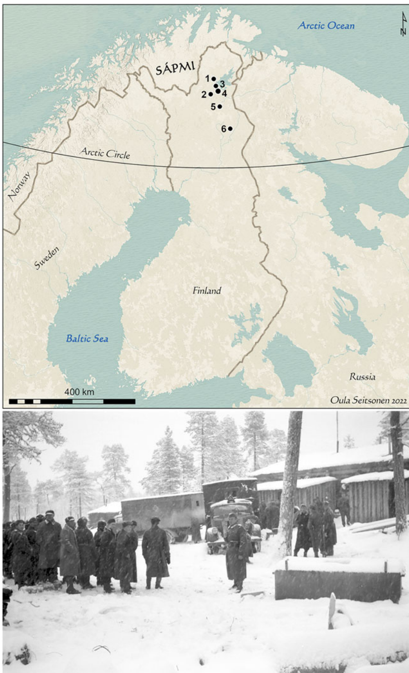
Figure 1. Top: Multinational Sápmi and the discussed sites in northern Finland. (1) Inari Hyljelahti; (2) Inari Haukkapesäoja; (3) Inari Kankiniemi; (4) Inari Martinkotajärvi; (5) Sodankylä Kopsusjärvi; (6) Savukoski Seitajärvi. (Background map: Esri.) Bottom: Soviet Prisoners of War (on the left) outside their log house with German guards (on the right) at Inari Haukkapesäoja, Lapland. (Photograph: Max Peronius 1941–1944/Antti Peronius.)

are still very much in the margins of both the research and the grand narratives of modern war. 1 Nonetheless, there are indications that superstitions, with their material/talismanic expressions, abounded also during WWII, as illustrated by MacKenzie's (2015; 2017; see also Gregory 2019) research on superstition as a means of coping with the constant threat of death. Recent work in Finland has indicated that premonitions and other strange ('supernatural') experiences were common among Finns both on