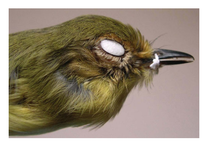
Figure 1. A male Minas Gerais Tyrannulet Phylloscartes roquettei collected in the Fazenda Santa Cruz, Felixlândia, Minas Gerais.