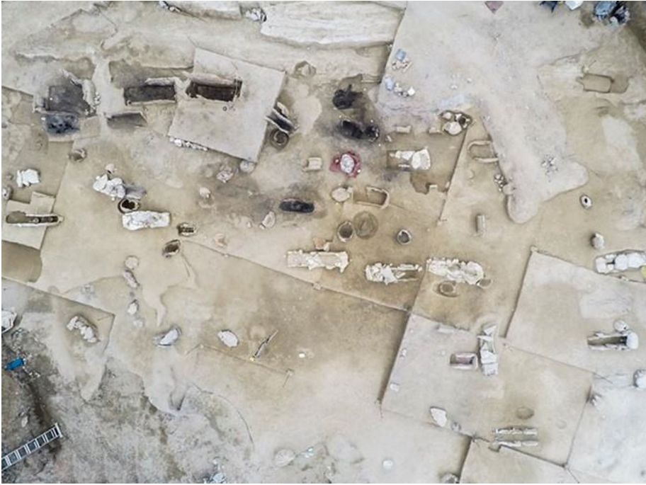
Fig. 8.4. Phaleron. Eastern part of the cemetery (Esplanade Sector) revealed in 2016.

Karligkioti and colleagues (2023) found high levels of hardship in rural populations in Attica ( Paiania, Koropi, Varambas, Agia Marina, Xereas ) from the Classical to the Roman period. Temporally, individuals from the earlier periods showed higher mechanical stress but lower physiological stress compared to those of later periods. With regard to sex differences, no significant differences were found between males and females in physiological stress. However, labour division changed between the Classical and Roman periods since the former was characterized by no sex difference in manual labour, while the latter witnessed greater mechanical stress among males compared to females. Although any interpretations emanating from this study are limited by the small sample sizes, it underscores the necessity of bringing together multiple lines of osteo-archaeological evidence.