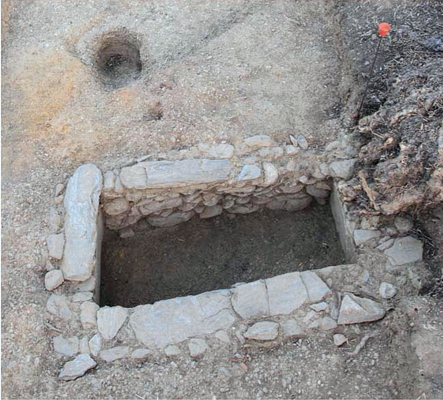
Fig. 8.5. Agios Vasiliios. Cist grave Tomb 23 and the pit for infant burials.

Furthermore, the mortuary practices gradually evolved to encompass different forms of secondary treatment of the deceased (e.g. skeletal disarticulation, commingling, and relocation), which may emphasize broader concepts of lineage and descent. In parallel, the co-existence of various burial practices (e.g. contracted and extended burials, intramural and extramural graves, small pits and large cists) suggested tensions between tradition and innovation as well as integration and differentiation. It is also important to mention Ioanna Moutafi's (2021) study on funerary practices and their social implications in Mycenaean Voudeni , Achaea. This research showed that the association between social change and mortuary practices is often reflected in subtle shifts in the treatment of the deceased.