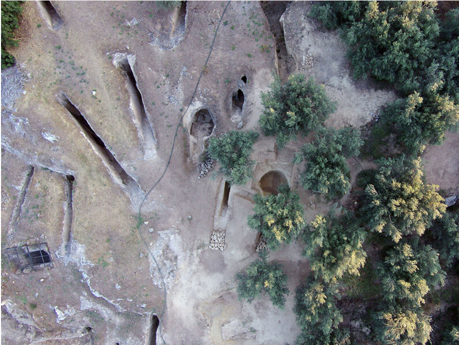
Fig. 8.2. Aidonia. Aerial photograph showing the dromos and chamber of the two new unplundered tombs in the E part of the Mycenaean cemetery, as well as tombs from the previous excavation.

Peloponnese, Makri in Thrace, and Tharrounia (ID14974) on Euboea. The results revealed genetic homogeneity in Greece until the Neolithic era, but a discontinuity between the Neolithic population and modern Greeks. Additionally, after the rapid spread of the Neolithic culture, mobility along the Danube expansion route decreased and genetic inputs from local hunter-gatherers on farming communities increased.