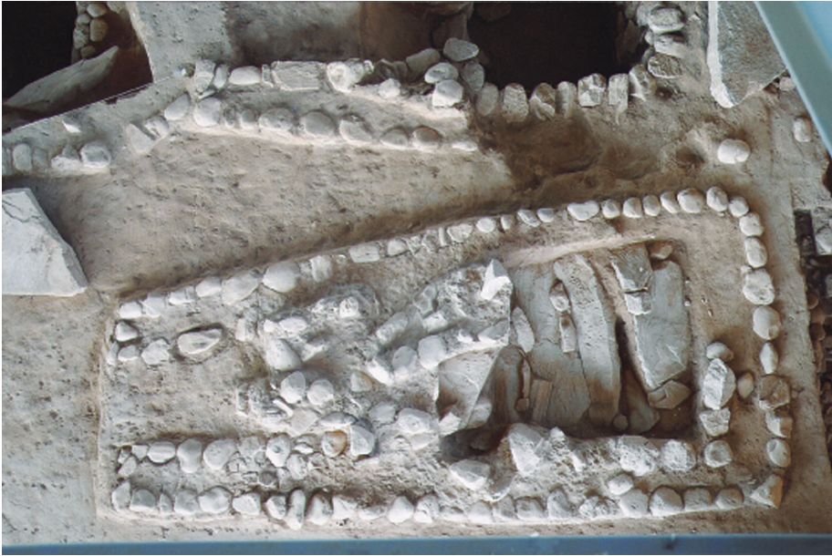
Fig. 8.1. Marathon, Tsepi. Tomb 43, © ASA.

Biodistance analysis has also been used to study mobility at a much smaller scale. An example of such an application involved the examination of kinship and postmarital residence patterns at the Tsepi cemetery (ID6140; Fig. 8.1) in prehistoric Marathon (Prevedorou and Stojanowski 2017). The intra-cemetery biodistances showed that various forms of kinship (biological, fictive, practical) were reflected in the burial practices. Biological lineages influenced the spatial arrangement of tombs to some extent, while male exogamy was postulated on the grounds of greater phenotypic (morphological) variation in males compared to females.