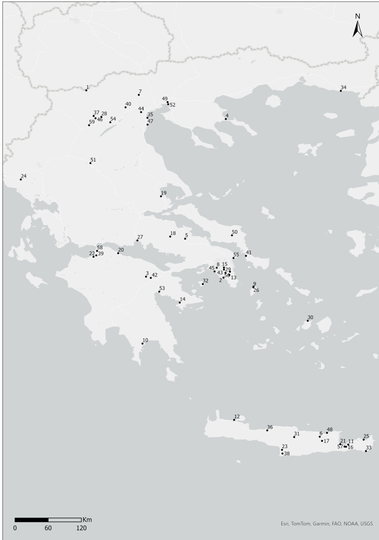
Map. 8.1. 1. Achlada; 2. Agia Marina, Xereas; 3. Aidonia; 4. Akanthos; 5. Akraiphia; 6. Aposelemis; 7. Archontiko; 8. Athens; 9. Aya Irini, Kea; 10. Ayios Vasilios North Cemetery; 11. Azoria; 12. Chania (ancient Kydonia); 13. Church of Taxiarches, Attica; 14. Franchthi Cave; 15. Glyka Nera; 16. Hagios Charalambos; 17. Hagios Sozon, Orchomenos; 18. Halasmenos; 19. Halos; 20. Helike; 21. Istron Kalo Chorio; 22. Kallithea; 23. Kamilari; 24. Kamini; 25. Kephala Petras; 26. Kephala, Kea; 27. Kirrha; 28. Kleitos; 29. Koropi; 30. Koukounaries; 31. Krousonas; 32. Lazarides; 33. Livari-Skiadi; 34. Makri; 35. Makriyalos; 36. Maroulas; 37. Mavropigi, Filotsairi; 38. Moni Odigitria; 39. Mygdalia; 40. Nea Nikomedeia; 41. Nea Styra; 42. Nemea; 43. Paiania; 44. Paliambela; 45. Phaleron; 46. Pontokomi-Vrysi; 47. Revenia; 48. Sissi; 49. Stavroupoli; 50. Tharrounia; 51. Theopetra Cave; 52. Thessaloniki; 53. Tiryns; 54. Toumba Kremastis Koiladas; 55. Tsepi; 56. Varambas; 57. Vasiliki; 58. Voudeni; 59. Xirolimni, Portes.

investigations, but also to advocate for enhanced collaboration, communication, and integration within the discipline.