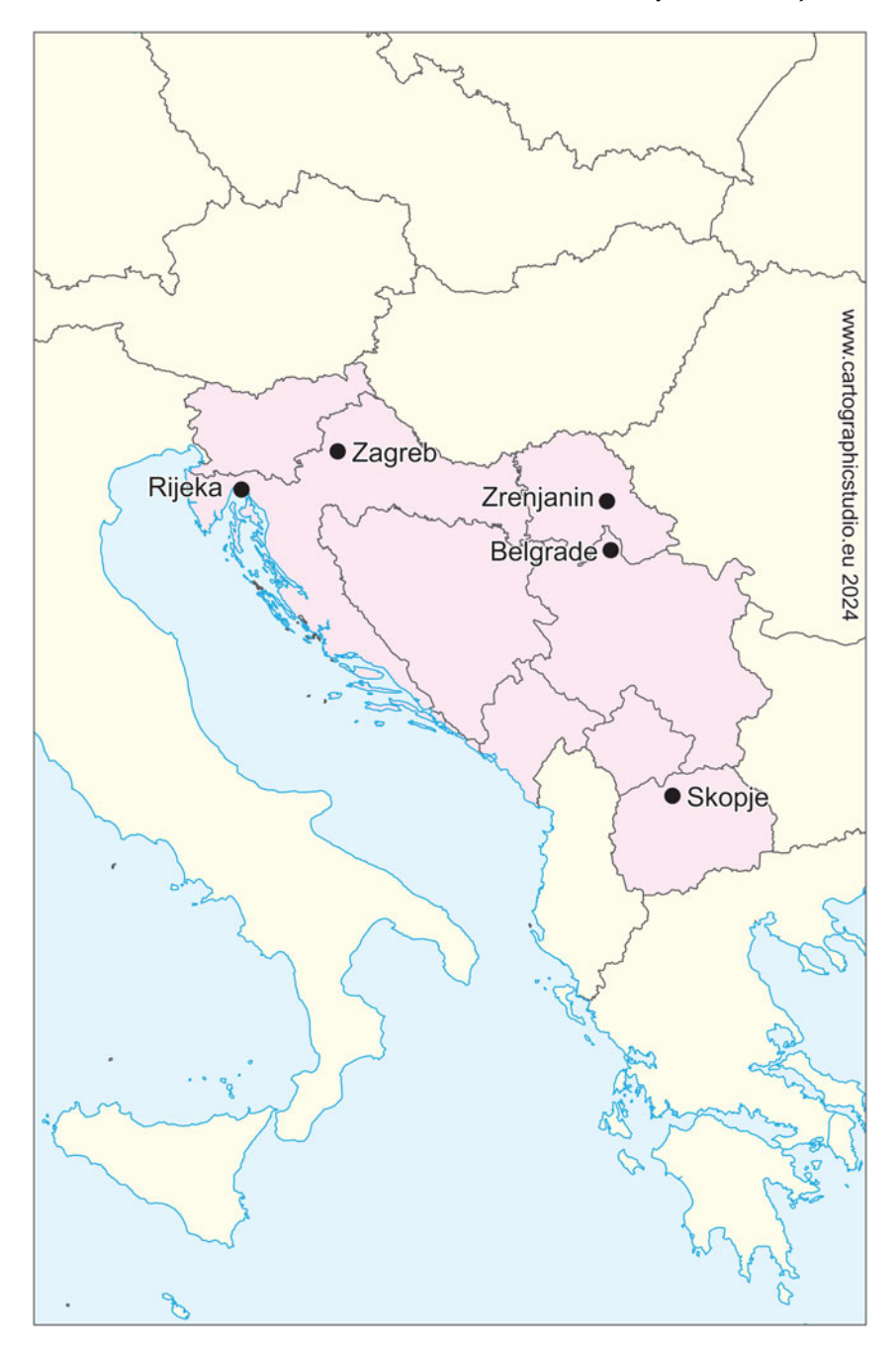
Figure 4. Socialist Yugoslavia in the early 1960s