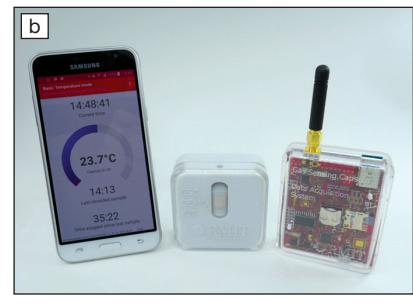
(a) Sensor-loaded capsule and the underlying sensor; (b) photo of the equipment including the phone app, capsule, and the data acquisition system.